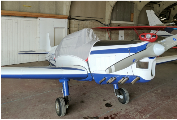
Zlin 326 Travel Cover

the hottest of days. It is water, ice and snow repellent, yet breathable to allow moisture to escape from between the cover and the aircraft surface.