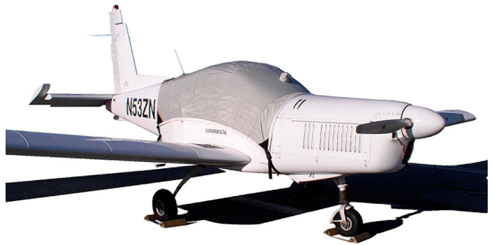
Zlin 142 Canopy Cover