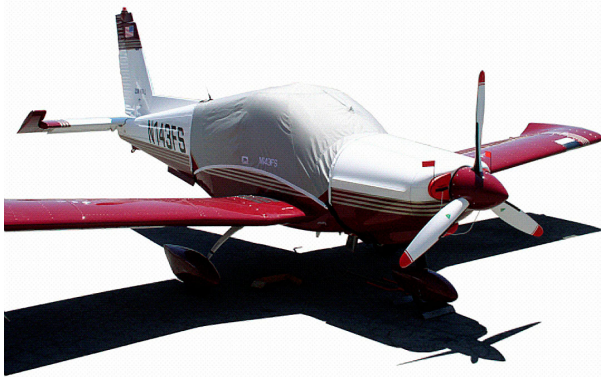
Zlin 143 Canopy Cover and Engine Plugs

The Zlin 42 Canopy/Engine Cover is a one-piece cover (100% lined with microfiber) that is a combination of the Canopy Cover and Engine Cover. This cover will enclose the engine cowl and will extend aft to cover all of the windows. This cover type is made from Silver Acrylic Sunbrella canvas and is 100% lined with a soft and smooth microfiber. Bruce's Custom Covers developed this material combination especially for aircraft protection. The outer material is medium weight and treated for water resistance, UV resistance and anti-static buildup. The inner lining is a very soft and smooth microfiber to prevent scratching. The material is very reflective, and tests show that the cabin interior temperature can be reduced to near-ambient temperature on the hottest of days. It is water, ice and snow repellent, yet breathable to allow moisture to escape from between the cover and the aircraft surface.