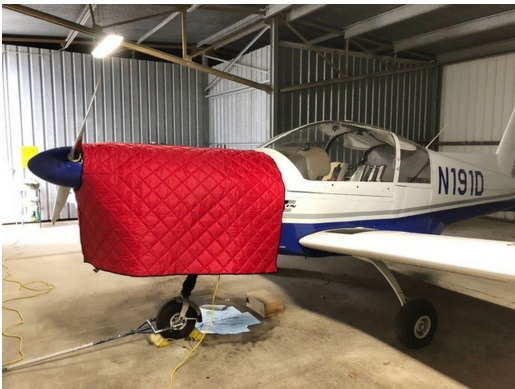
Zlin 142 Insulated Hangar Blanket