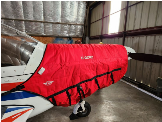
ZLIN 142C Insulated Engine Cover

This cover type is made from Silver Acrylic Sunbrella canvas and is 100% lined with a soft and smooth microfiber. Bruce's Custom Covers developed this material combination especially for aircraft protection. The outer material is medium weight and treated for water resistance, UV resistance and anti-static buildup. The inner lining is a very soft and smooth microfiber to prevent scratching. The material is very reflective, and tests show that the cabin interior temperature can be reduced to near-ambient temperature on the hottest of days. It is water, ice and snow repellent, yet breathable to allow moisture to escape from between the cover and the aircraft surface.