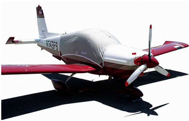
Zlin 143 Canopy Cover and Engine Plugs