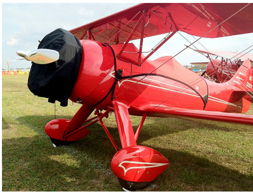
Waco UPF-7 Canopy & Engine Cover