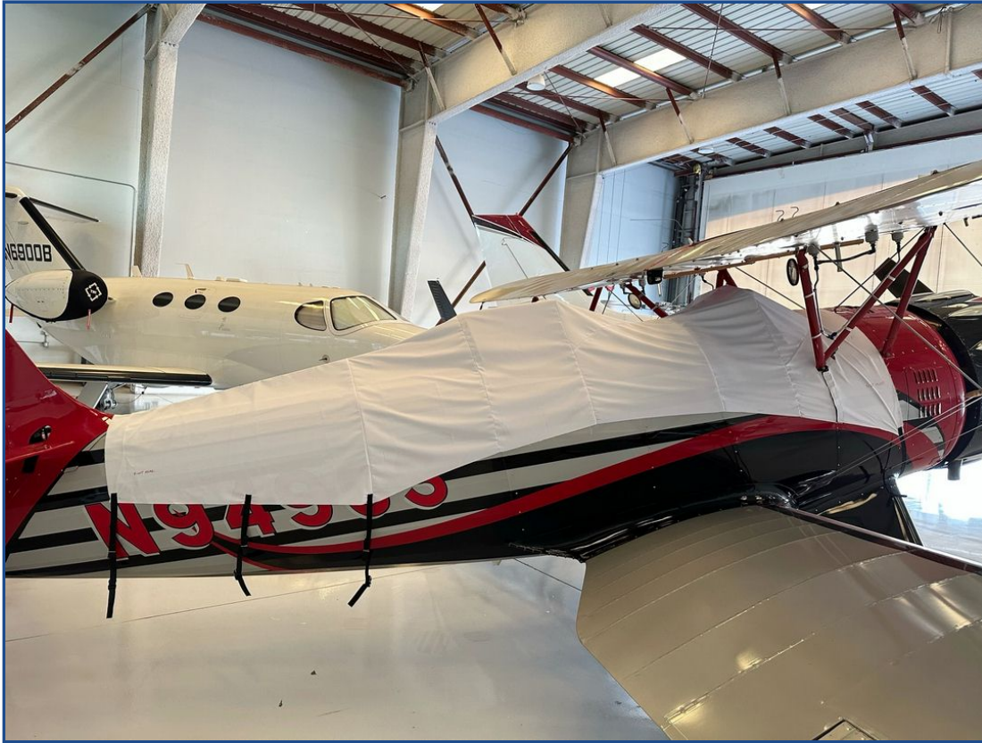
Waco YMF-5 Canopy with Turtledeck Extension, test fit cover