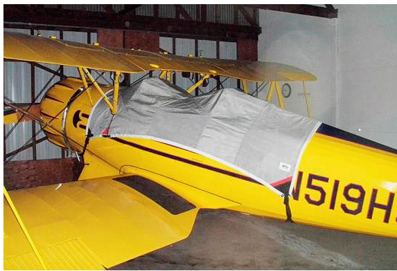
Waco YMF-5 Canopy Cover