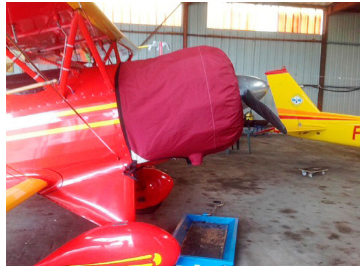
Waco Engine Cover