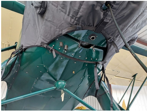
Wacon Cabin Biplane ZQC-6 Insulated Engine Cover