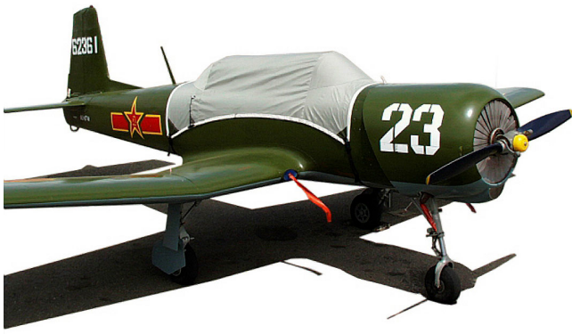
CJ-6 Nanchang Canopy Cover