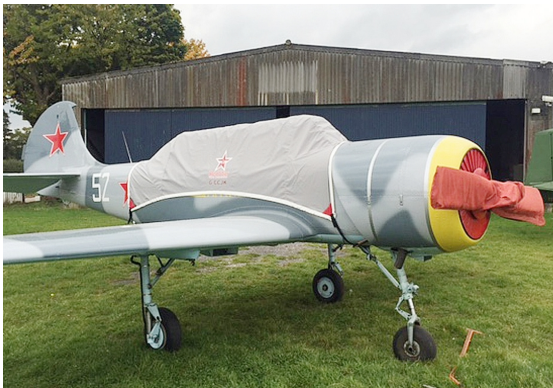
Yak 52 Canopy Cover

This cover type is made from Silver Acrylic Sunbrella canvas and is 100% lined with a soft and smooth microfiber. Bruce's Custom Covers developed this material combination especially for aircraft protection. The outer material is medium weight and treated for water resistance, UV resistance and anti-static buildup. The inner lining is a very soft and smooth microfiber to prevent scratching. The material is very reflective, and tests show that the cabin interior temperature can be reduced to near-ambient temperature on the hottest of days. It is water, ice and snow repellent, yet breathable to allow moisture to escape from between the cover and the aircraft surface.