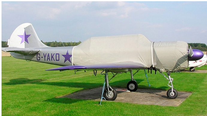
Yak 52 Extended Canopy, Engine & Horiz. Stab. Covers