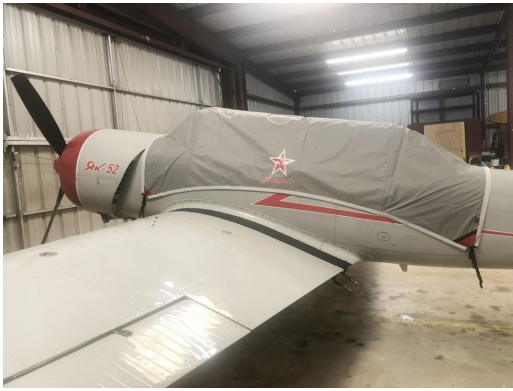
YAK 52TW Lightweight Travel Cover with Custom Artwork Imprint