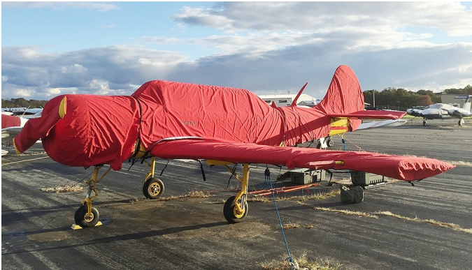
Yak 52 Full Cover Set