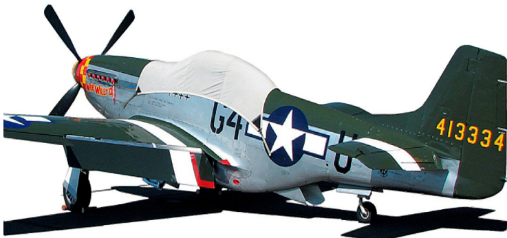
North American P51 Canopy Cover & Exhaust Plugs