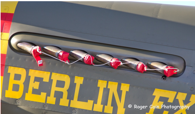
North American P-51 Exhaust Plugs

Engine Inlet Plugs are custom fit for your Yakovlev Yak 3 intakes, made with heavy-duty vinyl material, and stuffed with a single block of sculpted urethane foam. Each plug has a zipper that allows the foam to be removed and dried if necessary. Engine plugs have warning flags that are visible from the cockpit or 'remove before flight' streamers sewn onto the face of the plugs. Most plugs are imprinted with the aircraft registration number in black for an extra charge. Storage bag NOT included. Engine plugs may be inserted after flight when the engine is still warm. Engine Inlet Plugs are commonly referred to as Cowl Plugs, Intake Plugs, Cowl Blocks, Engine Blocks, and Engine Bungs.