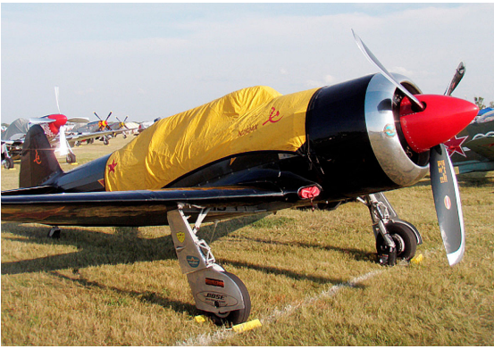
Yak 11 Canopy Cover, Plugs & Pitot Covers