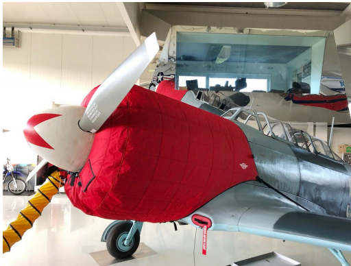
Yak 11 Insulated Engine Cover & Oil Cooler Inlet Plug

Engine Inlet Plugs are custom fit for your Yakovlev Yak 11 intakes, made with heavy-duty vinyl material, and stuffed with a single block of sculpted urethane foam. Each plug has a zipper that allows the foam to be removed and dried if necessary. Engine plugs have warning flags that are visible from the cockpit or 'remove before flight' streamers sewn onto the face of the plugs. Most plugs are imprinted with the aircraft registration number in black for an extra charge. Storage bag NOT included. Engine plugs may be inserted after flight when the engine is still warm. Engine Inlet Plugs are commonly referred to as Cowl Plugs, Intake Plugs, Cowl Blocks, Engine Blocks, and Engine Bungs.