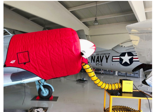
Yak 11 Insulated Engine Cover