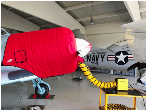
Yak 11 Insulated Engine Cover

Engine Inlet Plugs are custom fit for your Yakovlev Yak 11 intakes, made with heavy-duty vinyl material, and stuffed with a single block of sculpted urethane foam. Each plug has a zipper that allows the foam to be removed and dried if necessary. Engine plugs have warning flags that are visible from the cockpit or 'remove before flight' streamers sewn onto the face of the plugs. Most plugs are imprinted with the aircraft registration number in black for an extra charge. Storage bag NOT included. Engine plugs may be inserted after flight when the engine is still warm. Engine Inlet Plugs are commonly referred to as Cowl Plugs, Intake Plugs, Cowl Blocks, Engine Blocks, and Engine Bungs.