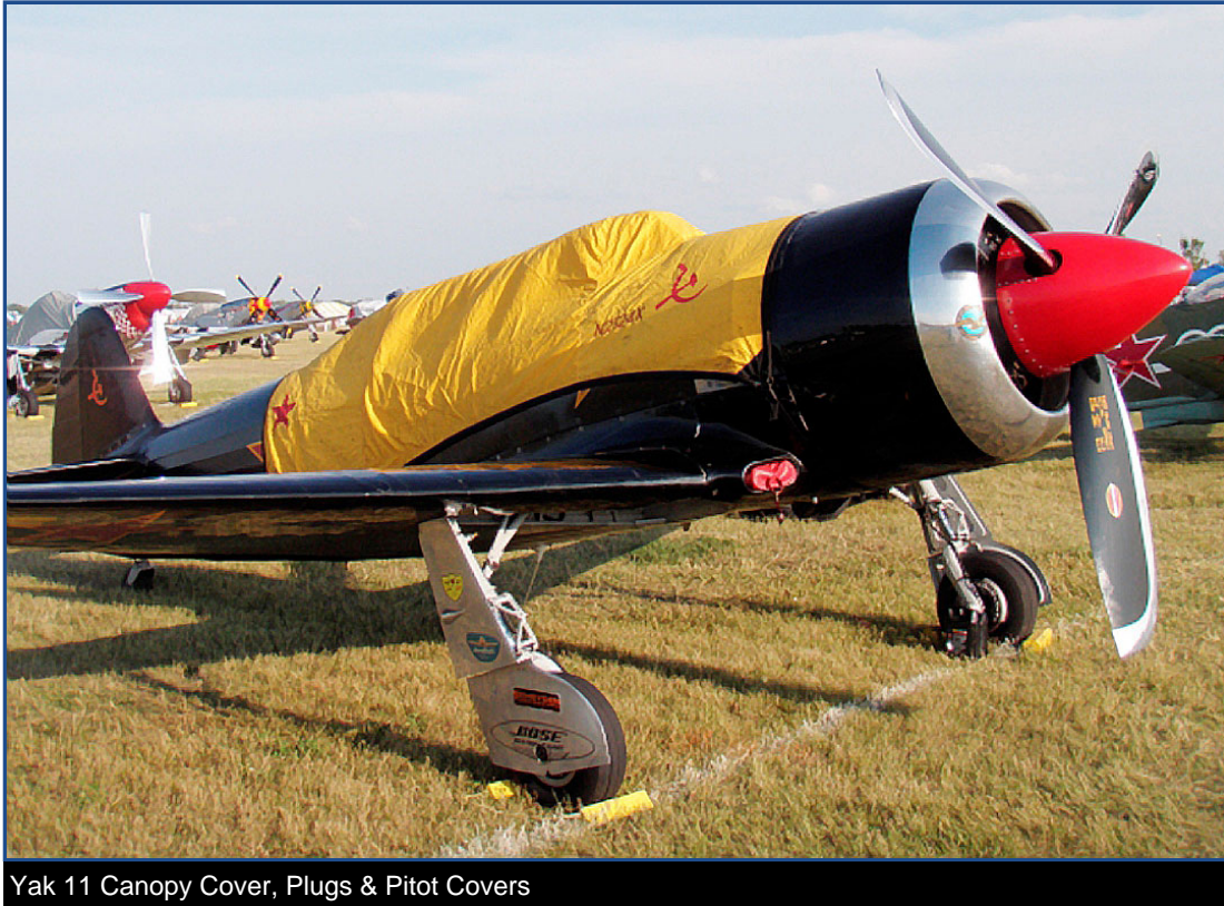
Yak 11 Canopy Cover, Plugs & Pitot Covers