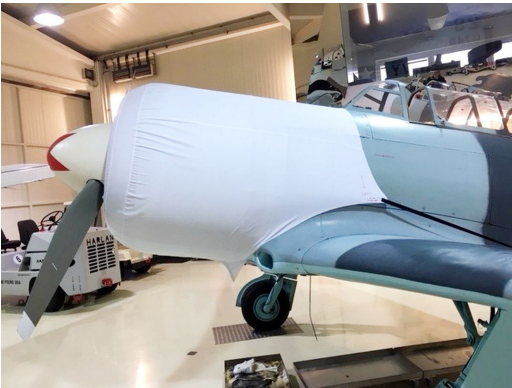
Yak 11 Engine Cover (test fit cover)