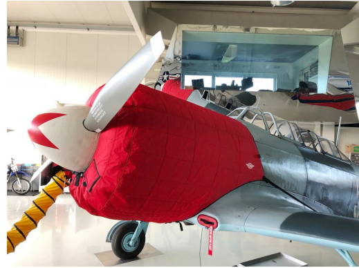
Yak 11 Insulated Engine Cover & Oil Cooler Inlet Plug