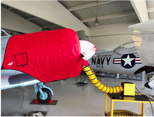
Yak 11 Insulated Engine Cover