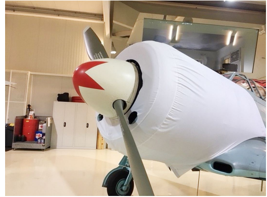
Yak 11 Engine Cover (test fit cover)