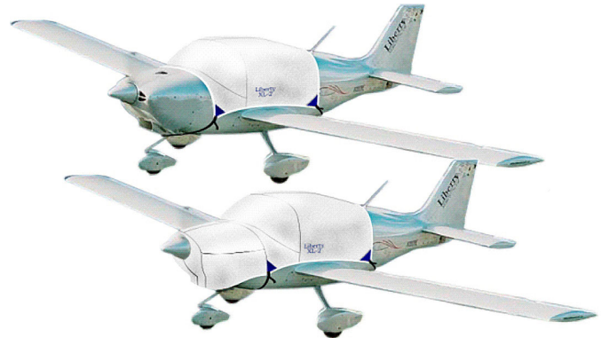
Canopy Cover & Canopy/Engine Cover (Illustration)