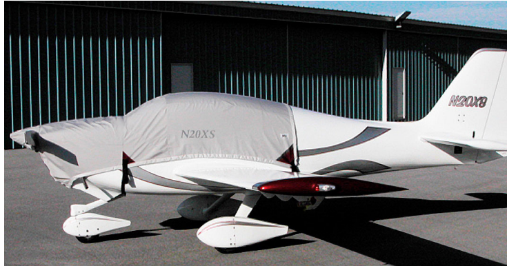
Canopy/Engine and Prop/Spinner Covers (tri-gear model)

Travel Covers are made with Silver Solution-Dyed Polyester fabric and only lined over the windshield to save weight. The material is lightweight and more compact for easy stowage in the aircraft. The polyester material is water resistant, but only intended for occasional use outside. We also have an ultra lightweight material available for fitted hangar dust covers. For daily outdoor use, the non-travel Sunbrella Cover is the best choice.