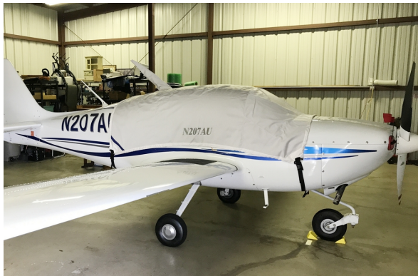
Liberty Aerospace Liberty XL-2 Canopy Cover

This cover type is made from Silver Acrylic Sunbrella canvas and is 100% lined with a soft and smooth microfiber. Bruce's Custom Covers developed this material combination especially for aircraft protection. The outer material is medium weight and treated for water resistance, UV resistance and anti-static buildup. The inner lining is a very soft and smooth microfiber to prevent scratching. The material is very reflective, and tests show that the cabin interior temperature can be reduced to near-ambient temperature on the hottest of days. It is water, ice and snow repellent, yet breathable to allow moisture to escape from between the cover and the aircraft surface.