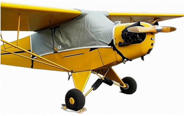
Piper J3 Canopy Cover