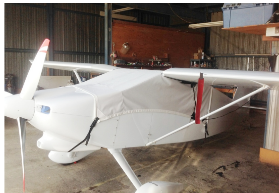
Wittman Tailwind Canopy Cover