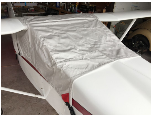
Wittman Tailwind Canopy Cover, Over-The-Top

This cover type is made from Silver Acrylic Sunbrella canvas and is 100% lined with a soft and smooth microfiber. Bruce's Custom Covers developed this material combination especially for aircraft protection. The outer material is medium weight and treated for water resistance, UV resistance and anti-static buildup. The inner lining is a very soft and smooth microfiber to prevent scratching. The material is very reflective, and tests show that the cabin interior temperature can be reduced to near-ambient temperature on the hottest of days. It is water, ice and snow repellent, yet breathable to allow moisture to escape from between the cover and the aircraft surface.