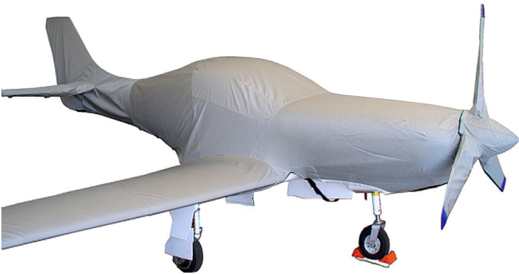
Lancair 320 Complete Fuselage/Wing Cover & Prop Cover

This cover type is made from Silver Acrylic Sunbrella canvas and is 100% lined with a soft and smooth microfiber. Bruce's Custom Covers developed this material combination especially for aircraft protection. The outer material is medium weight and treated for water resistance, UV resistance and anti-static buildup. The inner lining is a very soft and smooth microfiber to prevent scratching. The material is very reflective, and tests show that the cabin interior temperature can be reduced to near-ambient temperature on the hottest of days. It is water, ice and snow repellent, yet breathable to allow moisture to escape from between the cover and the aircraft surface.