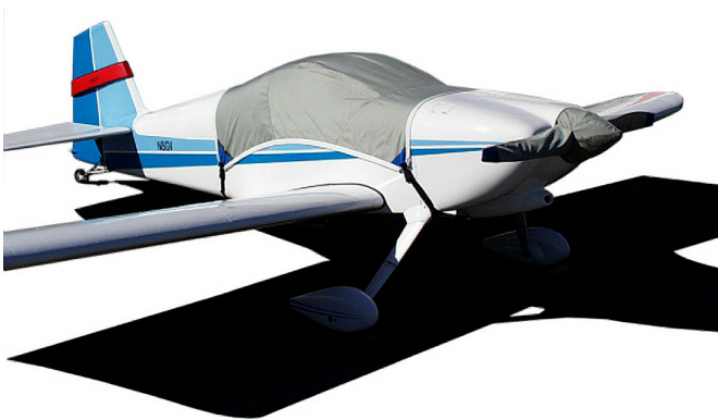
Canopy Cover, Prop Cover

This cover type is made from Silver Acrylic Sunbrella canvas and is 100% lined with a soft and smooth microfiber. Bruce's Custom Covers developed this material combination especially for aircraft protection. The outer material is medium weight and treated for water resistance, UV resistance and anti-static buildup. The inner lining is a very soft and smooth microfiber to prevent scratching. The material is very reflective, and tests show that the cabin interior temperature can be reduced to near-ambient temperature on the hottest of days. It is water, ice and snow repellent, yet breathable to allow moisture to escape from between the cover and the aircraft surface.