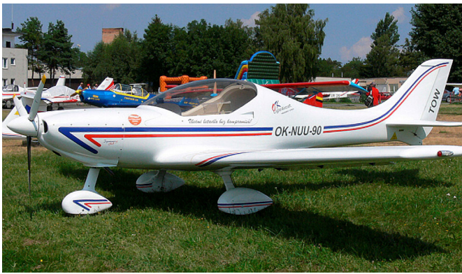
Covers, Plugs & HeatShields for Dynamic WT9