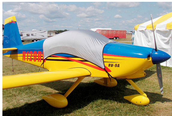
Van's RV-9A Light Weight Travel-Cover

Travel Covers are made with Silver Solution-Dyed Polyester fabric and only lined over the windshield to save weight. The material is lightweight and more compact for easy stowage in the aircraft. The polyester material is water resistant, but only intended for occasional use outside. We also have an ultra lightweight material available for fitted hangar dust covers. For daily outdoor use, the non-travel Sunbrella Cover is the best choice.