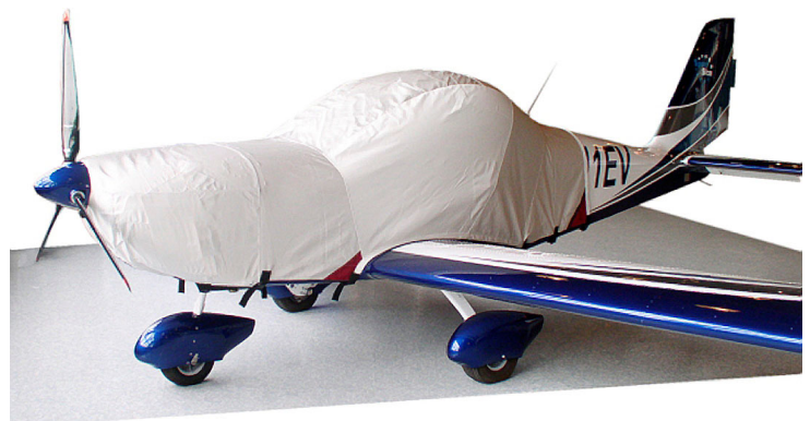
Evektor Sportstar Extended Canopy/Engine Cover