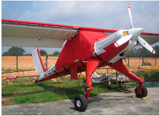
Wilga Canopy Cover

water resistance, UV resistance and anti-static buildup. The inner lining is a very soft and smooth microfiber to prevent scratching. The material is very reflective, and tests show that the cabin interior temperature can be reduced to near-ambient temperature on the hottest of days. It is water, ice and snow repellent, yet breathable to allow moisture to escape from between the cover and the aircraft surface.