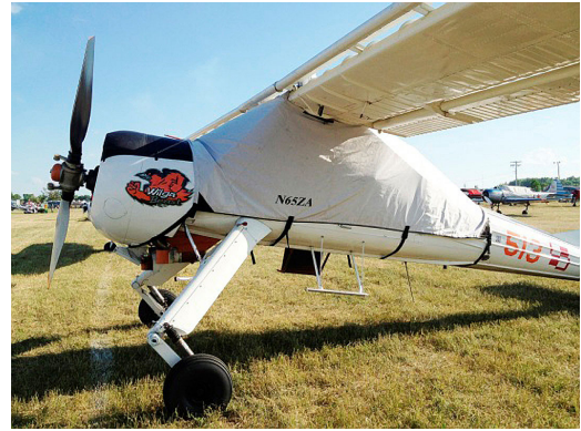
Wilga Canopy Cover