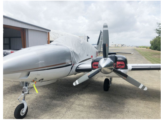
Baron G58 Engine Inlet Plugs