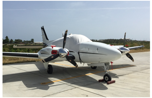
Baron 58 Canopy Cover, Engine Plugs