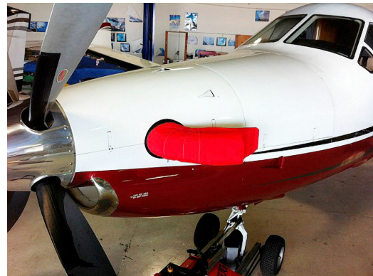
Pilatus PC-12 Exhaust Cover, Fully Enclosed, for protection against corrosion.