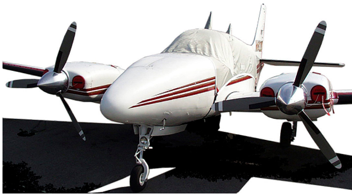
Baron 58 Standard Canopy Cover & Engine Plugs