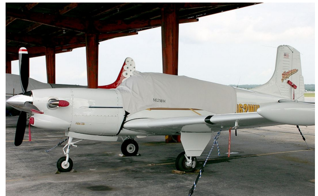
Beech Harpoon Canopy Cover, Exhaust Covers, Engine Plug