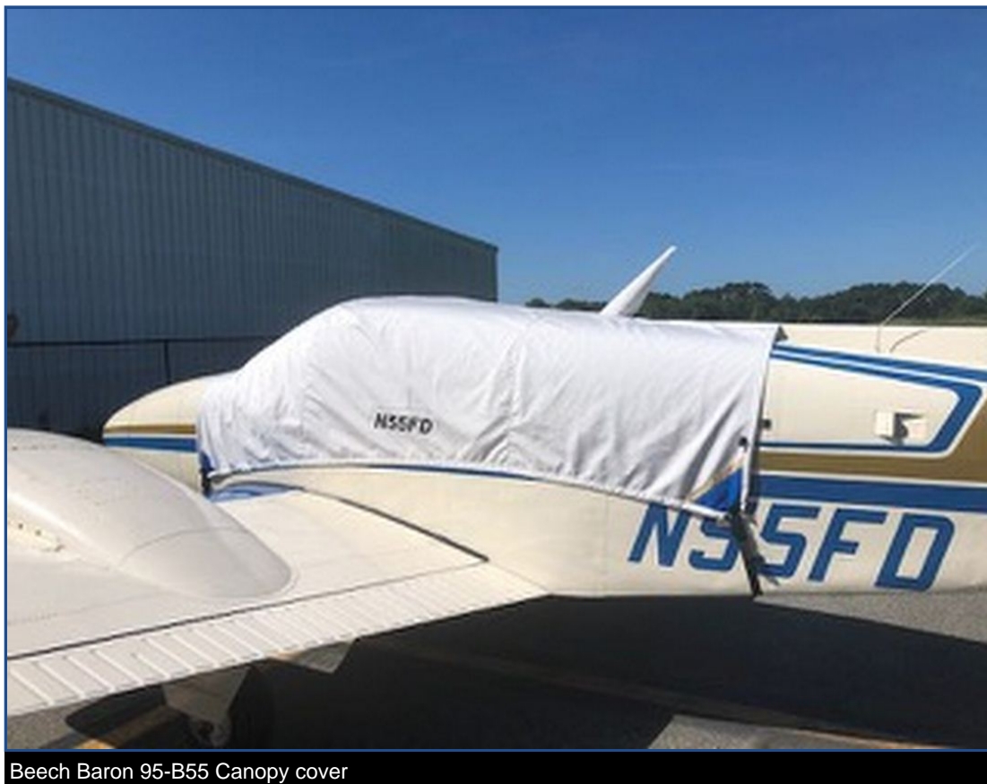
Beech Baron 95-B55 Canopy cover