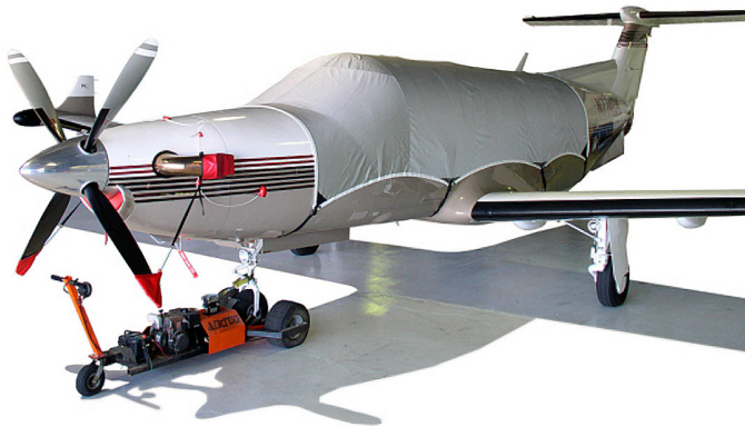
PC-12 Canopy Cover, Engine Plugs, Prop Tie/Exhaust Covers

Prop Tie-Down/Exhaust Covers are made of heavy duty red vinyl material. Thick nylon webbing runs from the exhaust covers to the prop boot. This webbing is adjustable with plastic buckles, and is held tight with a steel spring where it attaches to the prop boot.