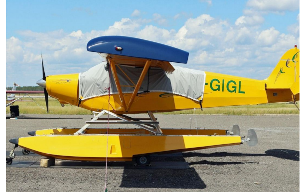
Wag Aero Sportsman 2+2 Canopy Cover