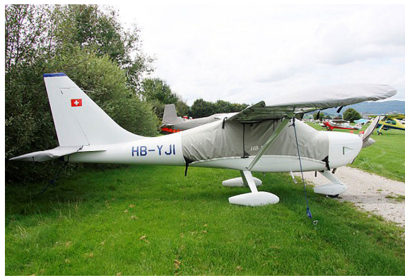
Glstar Canopy, Wings, Horizontal Stab. & Prop Covers