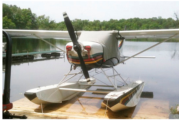
Glstar Sportsman Canopy Cover and Engine Plugs