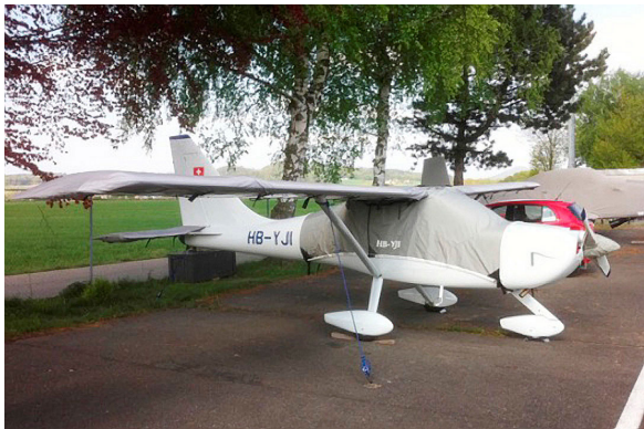
OMF Symphony Canopy, Wings, Horiz. Stab, and Prop Covers

This cover type is made from Silver Acrylic Sunbrella canvas and is 100% lined with a soft and smooth microfiber. Bruce's Custom Covers developed this material combination especially for aircraft protection. The outer material is medium weight and treated for water resistance, UV resistance and anti-static buildup. The inner lining is a very soft and smooth microfiber to prevent scratching. The material is very reflective, and tests show that the cabin interior temperature can be reduced to near-ambient temperature on the hottest of days. It is water, ice and snow repellent, yet breathable to allow moisture to escape from between the cover and the aircraft surface.