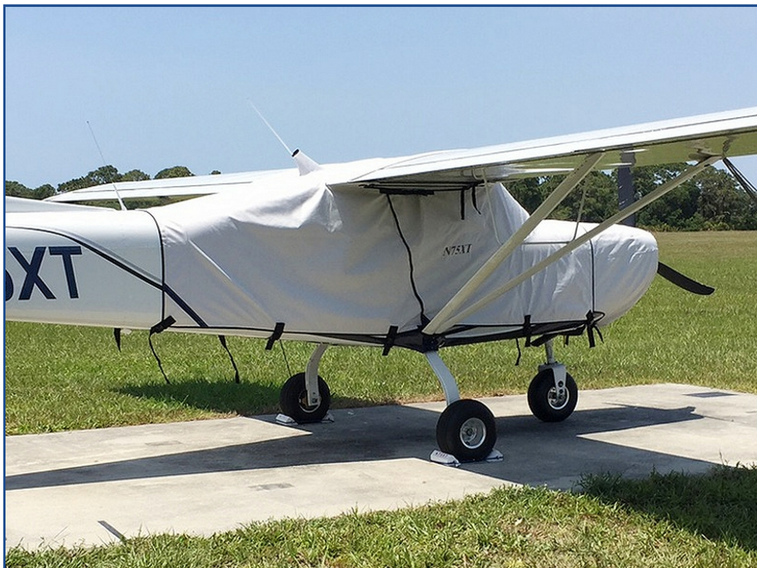
World Aircraft Extended Canopy Cover &amp; Engine Cover