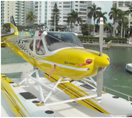
Glstar Engine Plugs