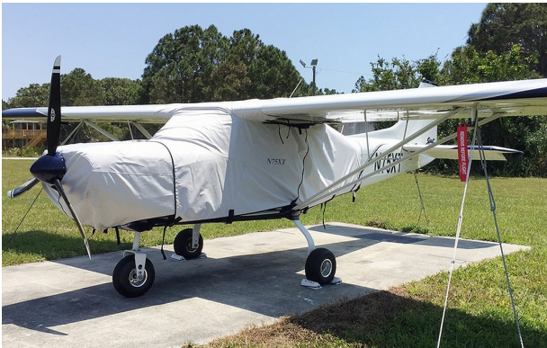
World Aircraft Extended Canopy Cover & Engine Cover