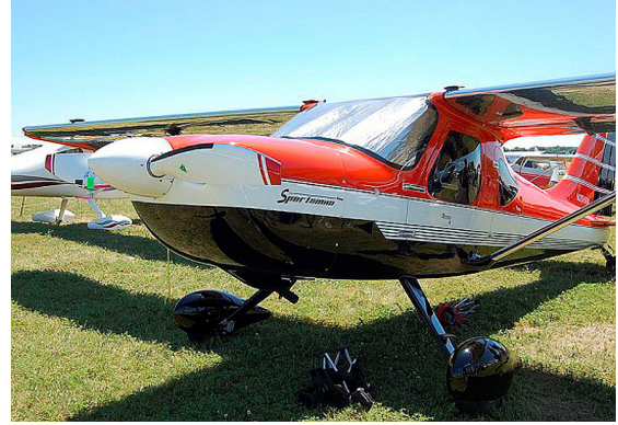
Glastar Sportsman Windshield HeatShield