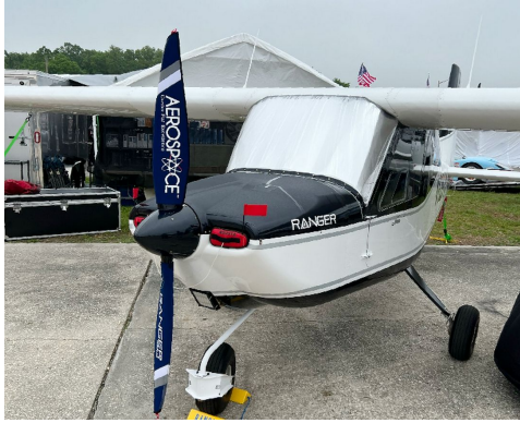
Vashon Ranger Engine Inlet Plugs

window framing. It folds up flat and easily stores in the included storage sleeve. Some designs may require velcro and suction cups or split right and left sides. A Heatshield is an excellent short-term remedy for cockpit overheating. An external fabric cover is far more effective and practical for long-term protection.