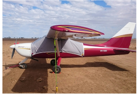
Glastar Sportsman Light Weight Travel Cover