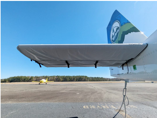
Vashon R7 Ranger Horiz. Stab. Covers, fully enclosed