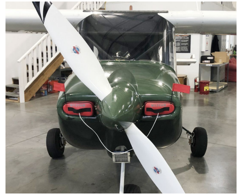
Vashon Ranger R7 Engine Plugs