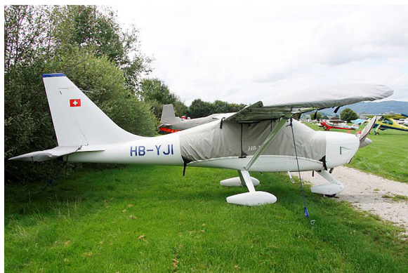
Glastar Canopy, Wings, Horizontal Stab. & Prop Covers

WINTER USE MATERIAL - Made with Solution-Dyed Polyester fabric, this option is intended for seasonal use to aid in deicing, rain mitigation, or for occasional travel. The material is lighter and more compact, but more susceptible to UV damage and may have a shorter useful life if used continuously outside than the all-year use material.