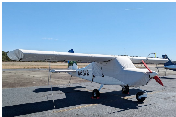
Vashon R7 Ranger Canopy/Engine, Wing & Horiz. Stab. Covers