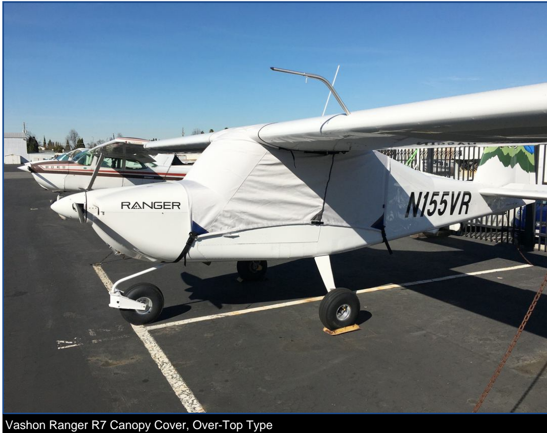
Vashon Ranger R7 Canopy Cover, Over-Top Type