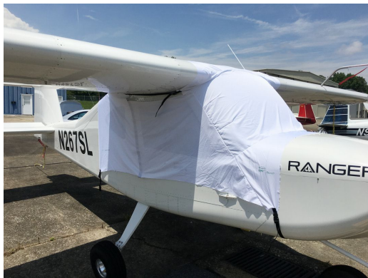
Vashon Ranger VR-7 Canopy Cover, test fit cover

Travel Covers are made with Silver Solution-Dyed Polyester fabric and only lined over the windshield to save weight. The material is lightweight and more compact for easy stowage in the aircraft. The polyester material is water resistant, but only intended for occasional use outside. We also have an ultra lightweight material available for fitted hangar dust covers. For daily outdoor use, the non-travel Sunbrella Cover is the best choice.