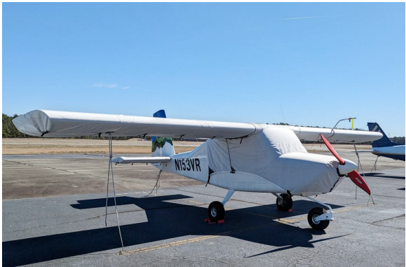
Glasair Aviation Glastar, Sportsman 2+2 Canopy Cover (Over-The-Top Style) Vashon R7 Ranger Canopy/Engine, Wing & Horiz. Stab. Covers