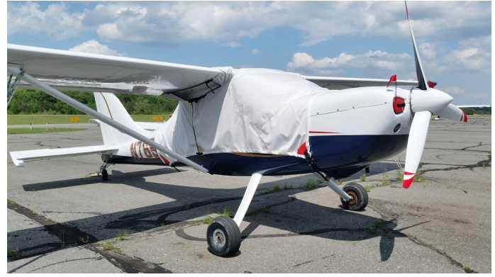
Glastar Over-Top Canopy Cover, Engine Plugs