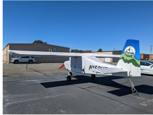
Vashon R7 Ranger Canopy/Engine, Wing & Horiz. Stab. Covers, fully enclosed