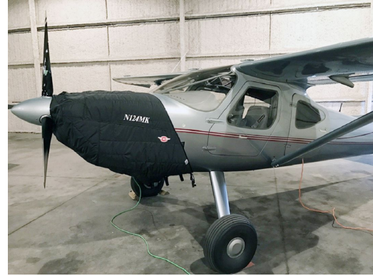
OMF Symphony Canopy, Wings, Horiz. Stab, and Prop Covers Glasair Aviation Glastar, Sportsman 2+2 Insulated Engine Cover