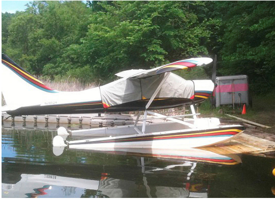
Glastar Sportsman Canopy Cover