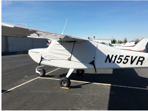
Vashon Ranger R7 Canopy Cover, Over-Top Type