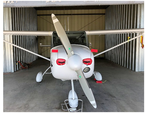
2006 OMF Symphony SA160