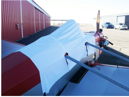
Volksplane Canopy Cover (test fit cover)

Travel Covers are made with Silver Solution-Dyed Polyester fabric and only lined over the windshield to save weight. The material is lightweight and more compact for easy stowage in the aircraft. The polyester material is water resistant, but only intended for occasional use outside. We also have an ultra lightweight material available for fitted hangar dust covers. For daily outdoor use, the non-travel Sunbrella Cover is the best choice.