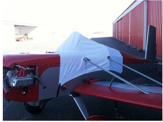
Volksplane Canopy Cover (test fit cover)