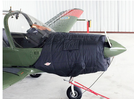
Scottish Aviation Bulldog Insulated Engine Cover