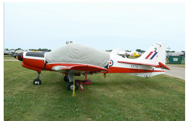
Scottish Aviation Bulldog Canopy Cover