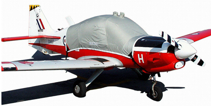
Scottish Aviation Bulldog Canopy Cover

This cover type is made from Silver Acrylic Sunbrella canvas and is 100% lined with a soft and smooth microfiber. Bruce's Custom Covers developed this material combination especially for aircraft protection. The outer material is medium weight and treated for water resistance, UV resistance and anti-static buildup. The inner lining is a very soft and smooth microfiber to prevent scratching. The material is very reflective, and tests show that the cabin interior temperature can be reduced to near-ambient temperature on the hottest of days. It is water, ice and snow repellent, yet breathable to allow moisture to escape from between the cover and the aircraft surface.