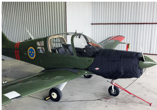
Scottish Aviation Bulldog Insulated Engine Cover