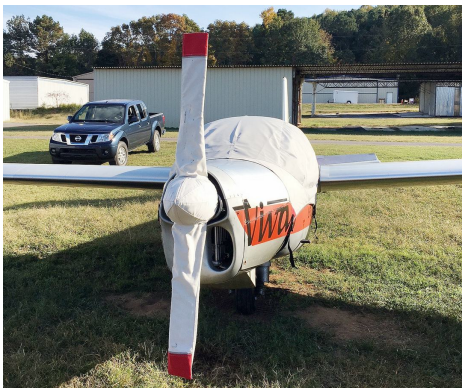
Aerotechnik L-13 Vivat Motorglider Prop/Spinner &amp; Canopy Covers