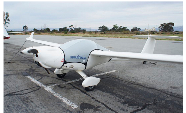
Lambda Canopy Cover