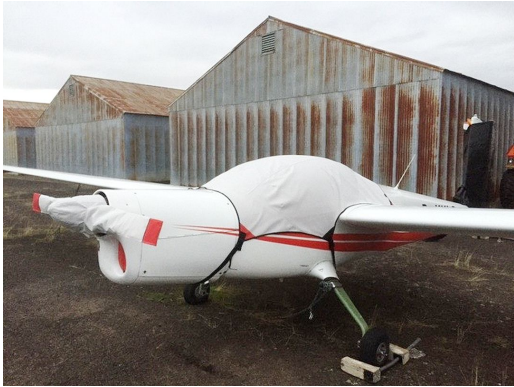
Vivat Canopy and Prop/Spinner Cover