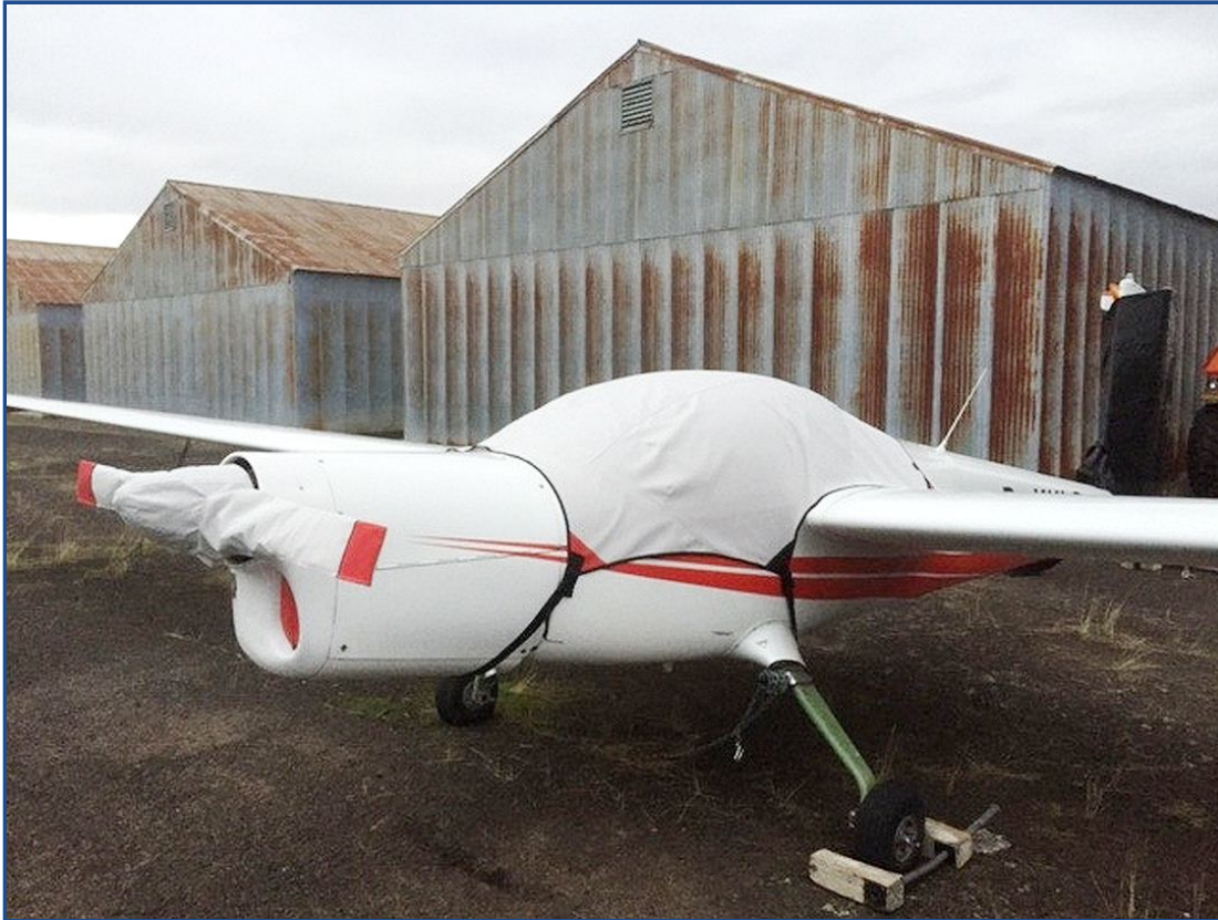
Vivat Canopy and Prop/Spinner Cover