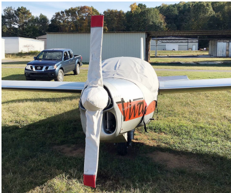
Aerotechnik L-13 Vivat Motorglider Prop/Spinner & Canopy Covers