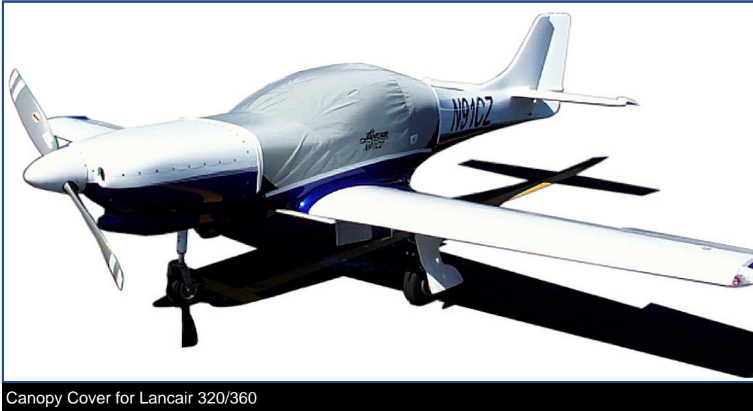
Canopy Cover for Lancair 320/360