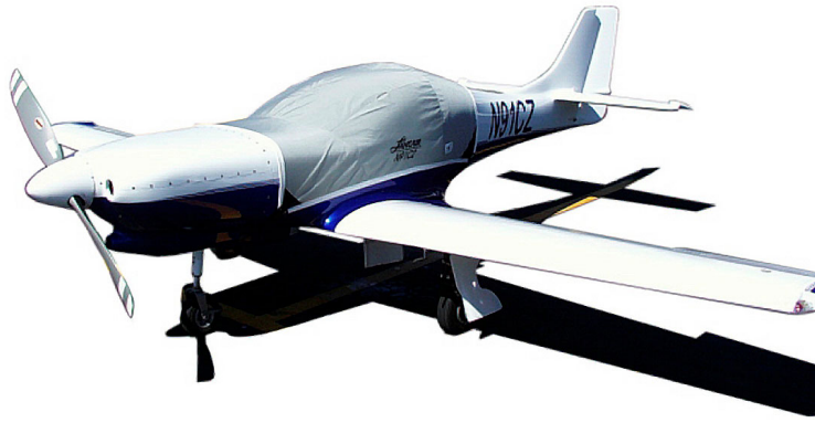
Canopy Cover for Lancair 320/360