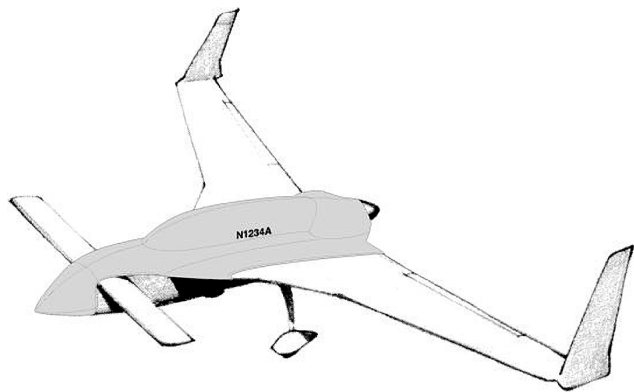
Rutan Long-EZ Canopy Cover