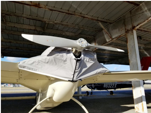
Rutan Vari EZ Travel Cover/Nose/Engine Cover