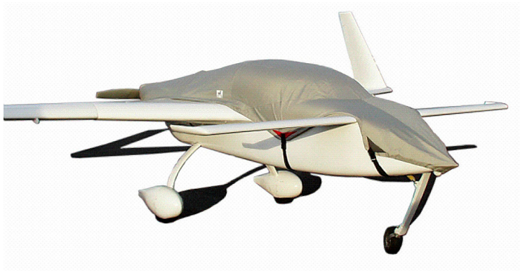
Cozy III Canopy/Nose/Engine Cover