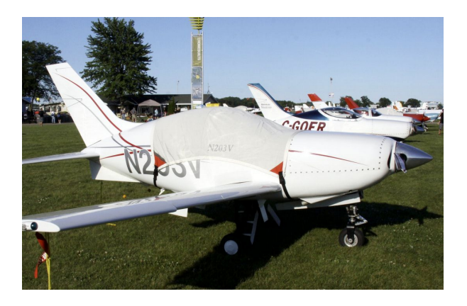
Questair Venture Canopy Cover