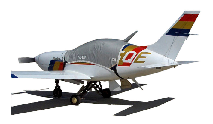
Questair Venture Canopy Cover