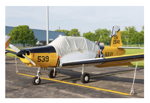
Varga Kachina Canopy Cover