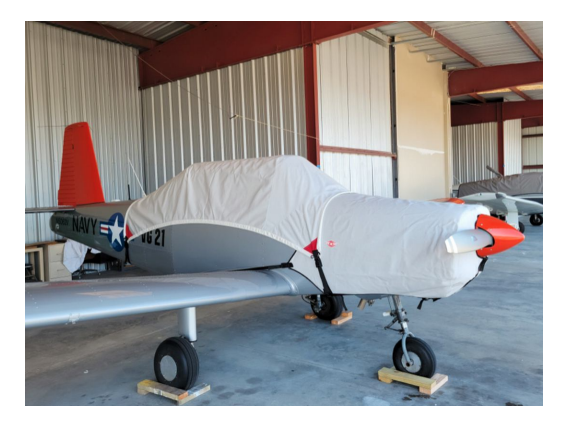
Varga Kachina Canopy & Engine Covers

This cover type is made from Silver Acrylic Sunbrella canvas and is 100% lined with a soft and smooth microfiber. Bruce's Custom Covers developed this material combination especially for aircraft protection. The outer material is medium weight and treated for water resistance, UV resistance and anti-static buildup. The inner lining is a very soft and smooth microfiber to prevent scratching. The material is very reflective, and tests show that the cabin interior temperature can be reduced to near-ambient temperature on the hottest of days. It is water, ice and snow repellent, yet breathable to allow moisture to escape from between the cover and the aircraft surface.