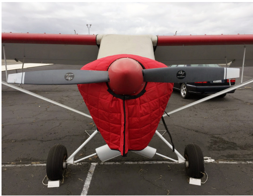
FOR INTERIOR USE. Cub Crafters CC-11 Insulated Hangar Blanket, available in Red or Silver

This cover type is made from Silver Acrylic Sunbrella canvas and is 100% lined with a soft and smooth microfiber. Bruce's Custom Covers developed this material combination especially for aircraft protection. The outer material is medium weight and treated for water resistance, UV resistance and anti-static buildup. The inner lining is a very soft and smooth microfiber to prevent scratching. The material is very reflective, and tests show that the cabin interior temperature can be reduced to near-ambient temperature on the hottest of days. It is water, ice and snow repellent, yet breathable to allow moisture to escape from between the cover and the aircraft surface.