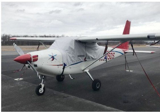
Vulcanair V1.0 canopy cover, Over Top style

This cover type is made from Silver Acrylic Sunbrella canvas and is 100% lined with a soft and smooth microfiber. Bruce's Custom Covers developed this material combination especially for aircraft protection. The outer material is medium weight and treated for water resistance, UV resistance and anti-static buildup. The inner lining is a very soft and smooth microfiber to prevent scratching. The material is very reflective, and tests show that the cabin interior temperature can be reduced to near-ambient temperature on the hottest of days. It is water, ice and snow repellent, yet breathable to allow moisture to escape from between the cover and the aircraft surface.