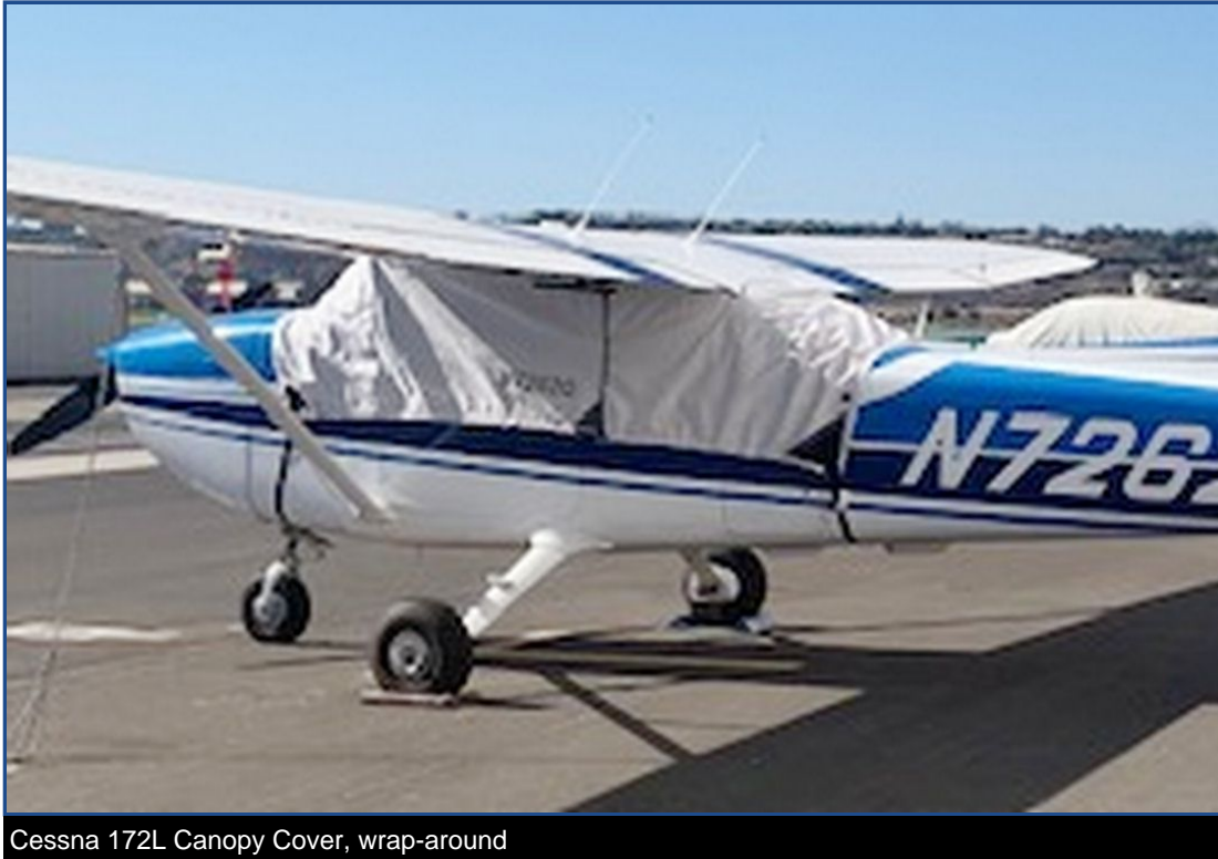
Cessna 172L Canopy Cover, wrap-around