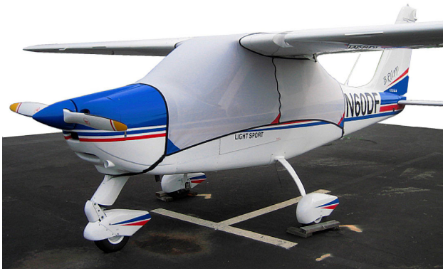
Tecnam Bravo Spandex FlyAway Travel Canopy Cover