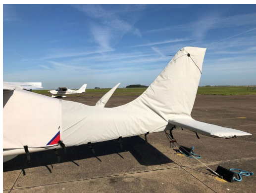
Tecnam P2008 Empennage Cover (Tailboom, Vertical & Horizontal Stabilizers), All Year Use

WINTER USE MATERIAL - Made with Solution-Dyed Polyester fabric, this option is intended for seasonal use to aid in deicing, rain mitigation, or for occasional travel. The material is lighter and more compact, but more susceptible to UV damage and may have a shorter useful life if used continuously outside than the all-year use material.