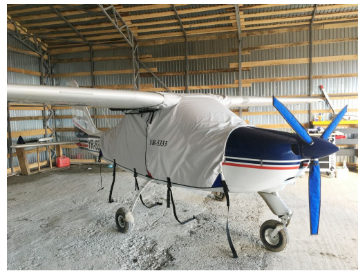
Tecnam P2004 Bravo Extended Canopy Cover, Over-Top Type