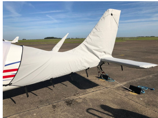
Tecnam P2008 Empennage Cover (Tailboom, Vertical & Horizontal Stabilizers), All Year Use