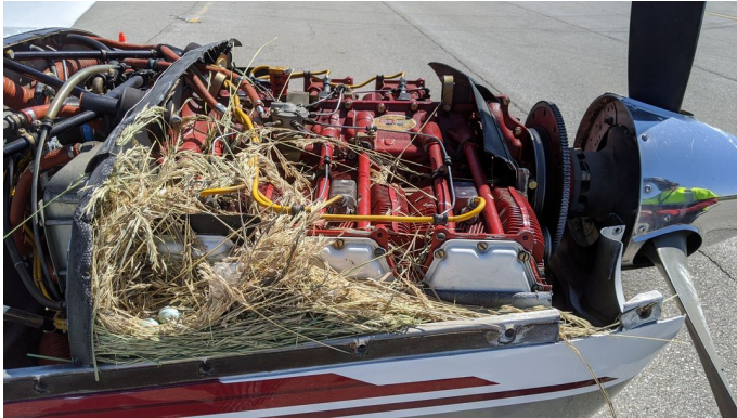
ENGINE PLUGS PREVENT BIRD NEST FOD. Piper Saratoga Engine Cowling Bird's Nest

Engine Inlet Plugs are custom fit for your Vulcanair V1.0 intakes, made with heavy-duty vinyl material, and stuffed with a single block of sculpted urethane foam. Each plug has a zipper that allows the foam to be removed and dried if necessary. Engine plugs have warning flags that are visible from the cockpit or 'remove before flight' streamers sewn onto the face of the plugs. Most plugs are imprinted with the aircraft registration number in black for an extra charge. Storage bag NOT included. Engine plugs may be inserted after flight when the engine is still warm. Engine Inlet Plugs are commonly referred to as Cowl Plugs, Intake Plugs, Cowl Blocks, Engine Blocks, and Engine Bungs.