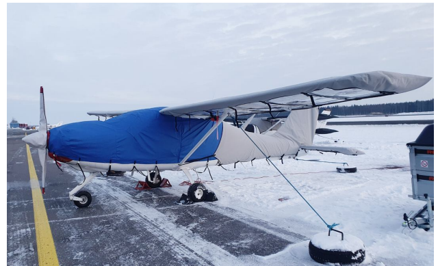
Tecnam P2008 Empennage Cover (Tailboom, Vertical & Horiz Stabilizers), All Year Use