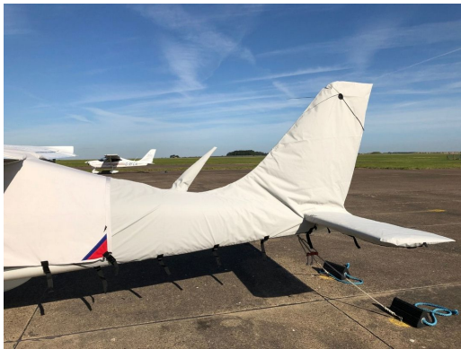
Tecnam P2008 Empennage Cover (Tailboom, Vertical & Horizontal Stabilizers), All Year Use

WINTER USE MATERIAL - Made with Solution-Dyed Polyester fabric, this option is intended for seasonal use to aid in deicing, rain mitigation, or for occasional travel. The material is lighter and more compact, but more susceptible to UV damage and may have a shorter useful life if used continuously outside than the all-year use material.