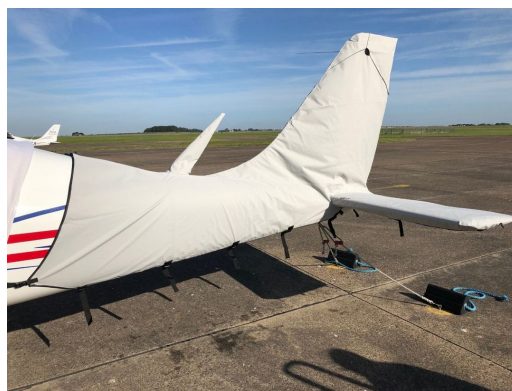
Tecnam P2008 Empennage Cover (Tailboom, Vertical & Horizontal Stabilizers), All Year Use