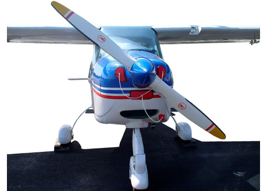
Tecnam Bravo Engine Plugs