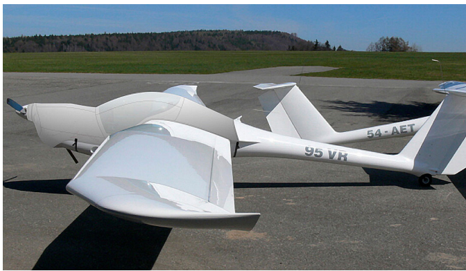
Lambda Canopy/Engine Cover (illustration)