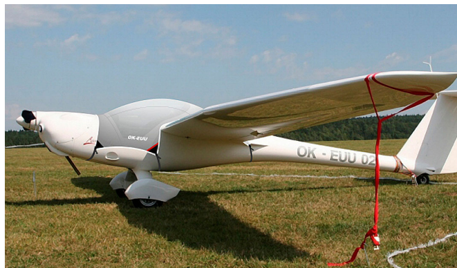
Lambda Canopy Cover (illustration)