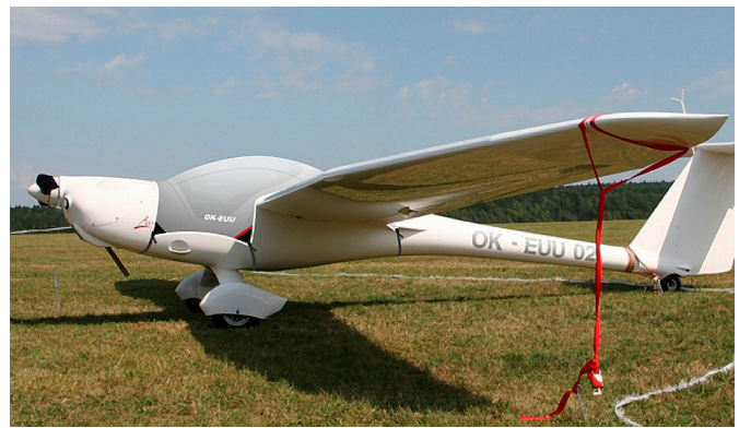
Lambda Canopy Cover (illustration)