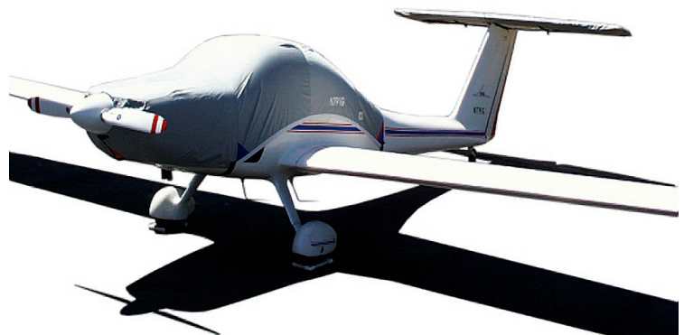
Grob 109 Canopy/Engine Cover & Horiz. Stabilizer Cover