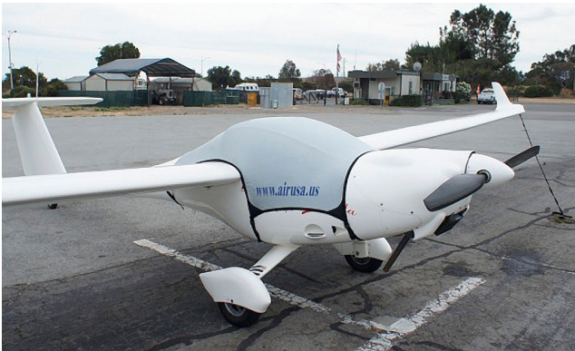
Lambda Travel Canopy Cover