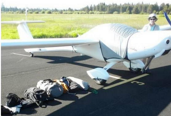
Distar Sundancer Travel Weight Canopy Cover