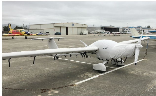
Lambda Canopy/Engine Cover and Wing Covers Distar Sundancer LSA Extended Canopy/Engine, Prop, Wheelpants, Wings & Empennage Covers