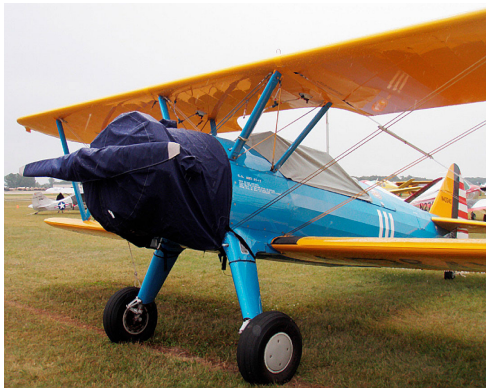
Stearman Canopy, Engine & Prop Covers