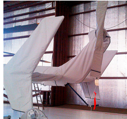
Tail Rotor Cover & Tailboom, Vertical Pylon & Stabilizers Cover