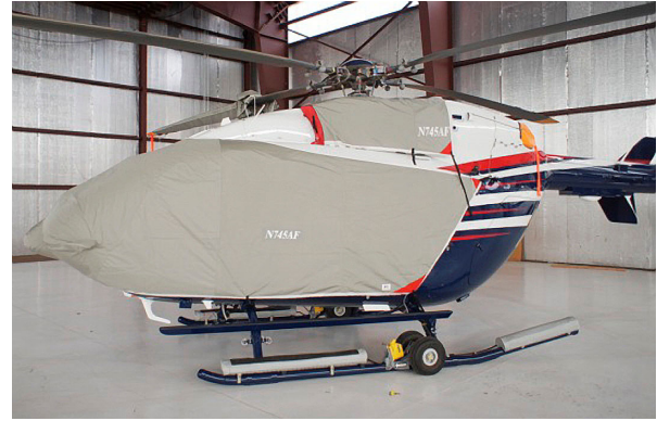
Upper Deck Plugs/Cover, extended to cover aft intake vents Bubble Cover w/ nose mounted radome, Upper Deck Plugs/Cover