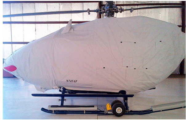
Eurocopter EC-145 Main Body Cover, also covers the bottom belly