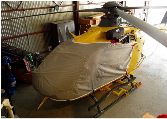
Eurocopter EC-135 Bubble Cover

Covers developed this material combination especially for aircraft protection. The outer material is medium weight and treated for water resistance, UV resistance and anti-static buildup. The inner lining is a very soft and smooth microfiber to prevent scratching. The material is very reflective, and tests show that the cabin interior temperature can be reduced to near-ambient temperature on the hottest of days. It is water, ice and snow repellent, yet breathable to allow moisture to escape from between the cover and the aircraft surface.