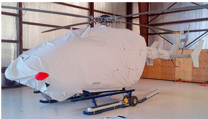
Main Body (also covers bottom), Tailboom, Vertical Pylon, Stabilizers and Tail Rotor Covers