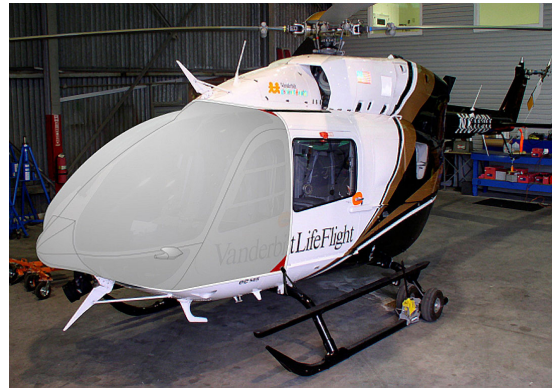
EC-145 Windshield/Nose Cover (illustration)