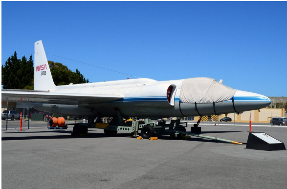
Lockheed U-2 Cockpit Cover

This cover type is made from Silver Acrylic Sunbrella canvas and is 100% lined with a soft and smooth microfiber. Bruce's Custom Covers developed this material combination especially for aircraft protection. The outer material is medium weight and treated for water resistance, UV resistance and anti-static buildup. The inner lining is a very soft and smooth microfiber to prevent scratching. The material is very reflective, and tests show that the cabin interior temperature can be reduced to near-ambient temperature on the hottest of days. It is water, ice and snow repellent, yet breathable to allow moisture to escape from between the cover and the aircraft surface.