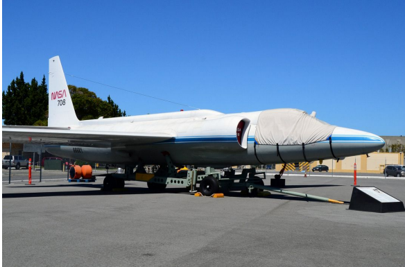
Lockheed U-2 Cockpit Cover

This cover type is made from Silver Acrylic Sunbrella canvas and is 100% lined with a soft and smooth microfiber. Bruce's Custom Covers developed this material combination especially for aircraft protection. The outer material is medium weight and treated for water resistance, UV resistance and anti-static buildup. The inner lining is a very soft and smooth microfiber to prevent scratching. The material is very reflective, and tests show that the cabin interior temperature can be reduced to near-ambient temperature on the hottest of days. It is water, ice and snow repellent, yet breathable to allow moisture to escape from between the cover and the aircraft surface.