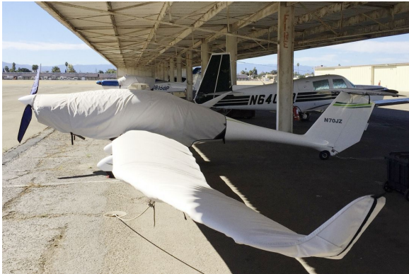
Phoenix Air U-15 Canopy/Engine, Wing & Horizontal Stabilizer Covers