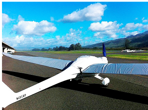
Lambada Canopy/Engine Cover and Wing Covers