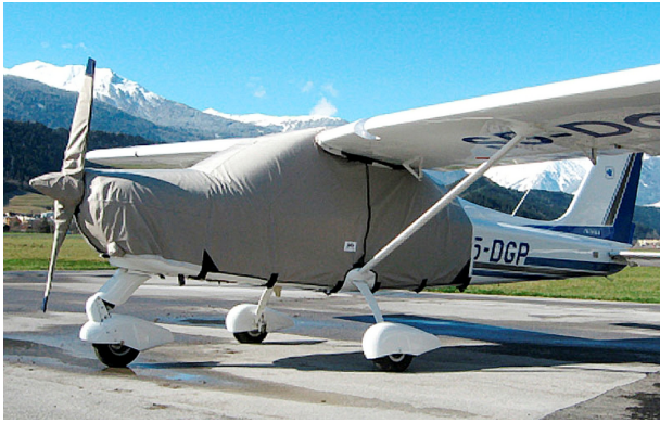
Tecnam Echo Extended Canopy, Engine, Prop Covers

the hottest of days. It is water, ice and snow repellent, yet breathable to allow moisture to escape from between the cover and the aircraft surface.