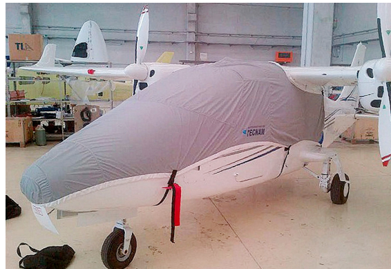
Tecnam P2006T Twin Lightweight Travel Canopy/Nose Cover

Travel Covers are made with Silver Solution-Dyed Polyester fabric and only lined over the windshield to save weight. The material is lightweight and more compact for easy stowage in the aircraft. The polyester material is water resistant, but only intended for occasional use outside. We also have an ultra lightweight material available for fitted hangar dust covers. For daily outdoor use, the non-travel Sunbrella Cover is the best choice.