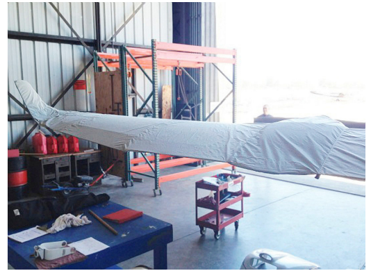
Tecnam Twin Wing/Engine Covers