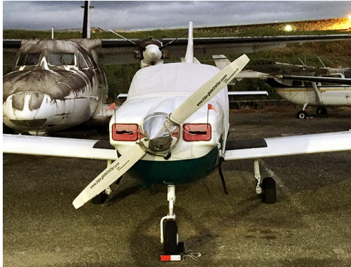
Socata TB9 Tampico Canopy Cover and Engine Inlet Plugs

Engine Inlet Plugs are custom fit for your Socata Tampico, Tobago & Trinidad intakes, made with heavy-duty vinyl material, and stuffed with a single block of sculpted urethane foam. Each plug has a zipper that allows the foam to be removed and dried if necessary. Engine plugs have warning flags that are visible from the cockpit or 'remove before flight' streamers sewn onto the face of the plugs. Most plugs are imprinted with the aircraft registration number in black for an extra charge. Storage bag NOT included. Engine plugs may be inserted after flight when the engine is still warm. Engine Inlet Plugs are commonly referred to as Cowl Plugs, Intake Plugs, Cowl Blocks, Engine Blocks, and Engine Bungs.