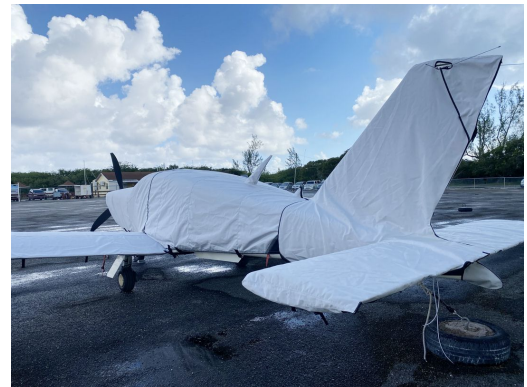
Socata Trinidad Full Cover Set