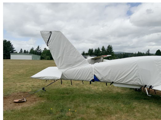
Socata Tampico TB-9C Cover Set