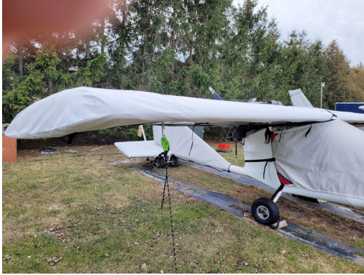
Titan Tornado Canopy/Nose, Wings & Empennage Cover

WINTER USE MATERIAL - Made with Solution-Dyed Polyester fabric, this option is intended for seasonal use to aid in deicing, rain mitigation, or for occasional travel. The material is lighter and more compact, but more susceptible to UV damage and may have a shorter useful life if used continuously outside than the all-year use material.