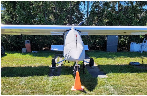
Titan Tornado Canopy/Nose Cover