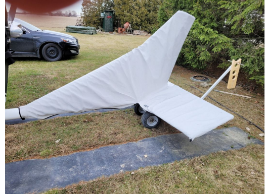
Titan Tornado Empennage Cover