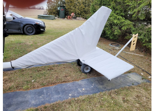
Titan Tornado Empennage Cover