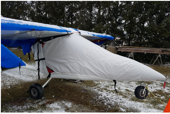
Titan Tornado Canopy/Nose Cover