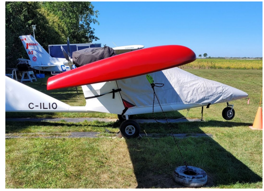
Titan Tornado Canopy/Nose Cover