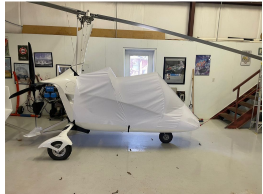
Autogyro MTOSPORT Travel Cover, Light Weight Canopy/Nose Cover MTO Sport Gyrocopter Canopy/Nose Cover, test fit cover