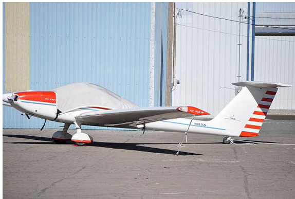
Grob 109 Canopy Cover