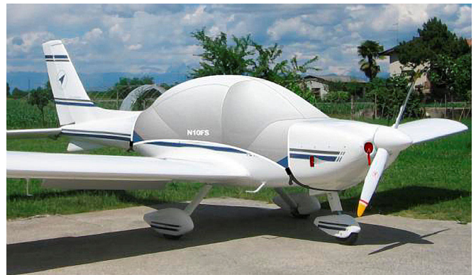
Texan Canopy Cover & Engine Plugs (Illustration)