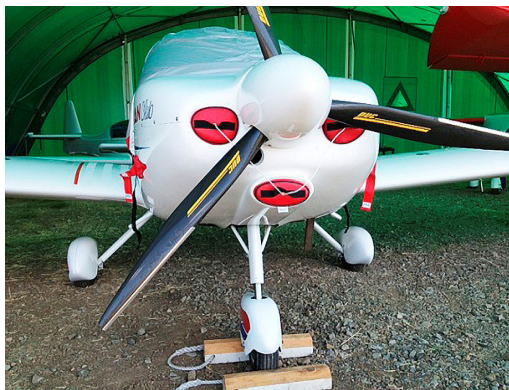
Texan Club Sport 550 Lightweight Travel Cover and Engine Inlet Plugs set