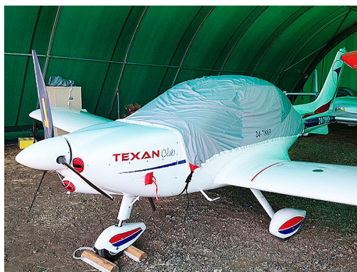
Texan Club Sport 550 Lightweight Travel Cover and Engine Inlet Plugs set