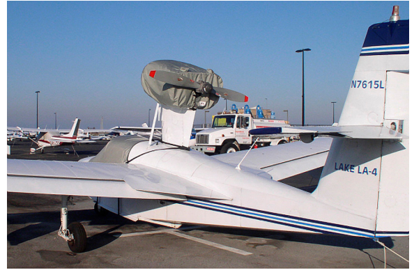
Lake Canopy & Engine Covers