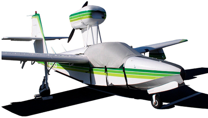
Lake LA-250 Canopy Cover