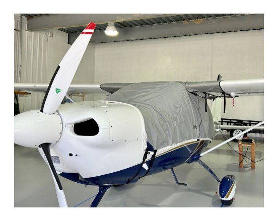
Tecnam P2010 Lightweight Travel Canopy Cover

occasional use outside. We also have an ultra lightweight material available for fitted hangar dust covers. For daily outdoor use, the non-travel Sunbrella Cover is the best choice.