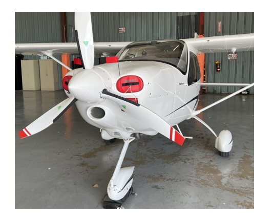
Tecnam P2010 Engine Plugs