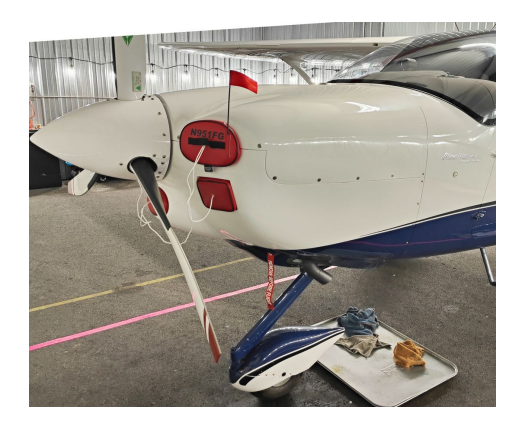
Tecnam P2010 Engine Inlet Plugs