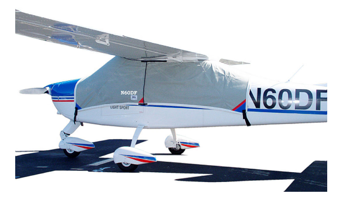
Tecnam Bravo Canopy Cover