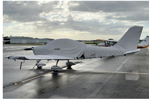
Tecnam P2002 Sierra Complete Cover Set