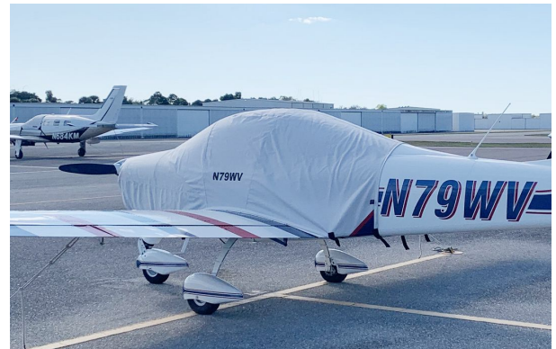
Tecnam Sierra Extended Canopy/Engine Cover