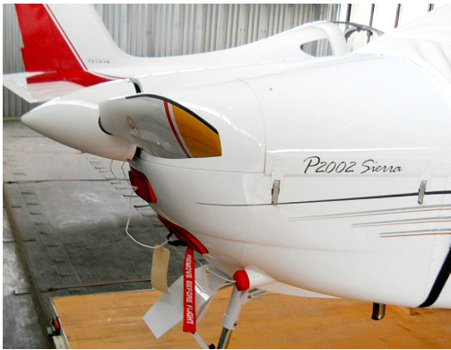
Tecnam Sierra Engine Inlet Plugs set

Engine Inlet Plugs are custom fit for your Tecnam P2002 Sierra, P96 Golf, P-Mentor intakes, made with heavy-duty vinyl material, and stuffed with a single block of sculpted urethane foam. Each plug has a zipper that allows the foam to be removed and dried if necessary. Engine plugs have warning flags that are visible from the cockpit or 'remove before flight' streamers sewn onto the face of the plugs. Most plugs are imprinted with the aircraft registration number in black for an extra charge. Storage bag NOT included. Engine plugs may be inserted after flight when the engine is still warm. Engine Inlet Plugs are commonly referred to as Cowl Plugs, Intake Plugs, Cowl Blocks, Engine Blocks, and Engine Bungs.