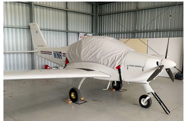
Tecnam P2002 Sierra Canopy Cover