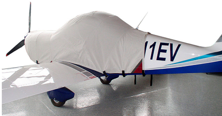
Evektor Sportstar Extended Canopy/Engine Cover

This cover type is made from Silver Acrylic Sunbrella canvas and is 100% lined with a soft and smooth microfiber. Bruce's Custom Covers developed this material combination especially for aircraft protection. The outer material is medium weight and treated for water resistance, UV resistance and anti-static buildup. The inner lining is a very soft and smooth microfiber to prevent scratching. The material is very reflective, and tests show that the cabin interior temperature can be reduced to near-ambient temperature on the hottest of days. It is water, ice and snow repellent, yet breathable to allow moisture to escape from between the cover and the aircraft surface.