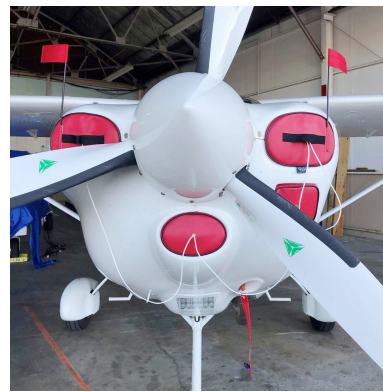
Tecnam Engine Plugs, set of 5