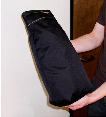
Light Weight Travel-Cover Mini-Storage Bag: 18" x 6" x 4"

Travel Covers are made with Silver Solution-Dyed Polyester fabric and only lined over the windshield to save weight. The material is lightweight and more compact for easy stowage in the aircraft. The polyester material is water resistant, but only intended for occasional use outside. We also have an ultra lightweight material available for fitted hangar dust covers. For daily outdoor use, the non-travel Sunbrella Cover is the best choice.