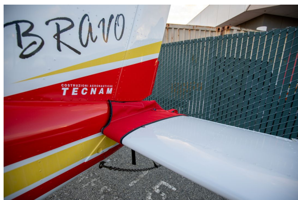
Tecnam Bravo Tailcone Cover

WINTER USE MATERIAL - Made with Solution-Dyed Polyester fabric, this option is intended for seasonal use to aid in deicing, rain mitigation, or for occasional travel. The material is lighter and more compact, but more susceptible to UV damage and may have a shorter useful life if used continuously outside than the all-year use material.