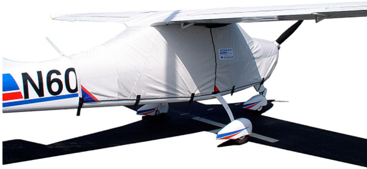
Tecnam Bravo Extended Canopy/Engine Cover