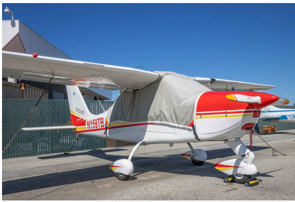
Tecnam P2004 Bravo