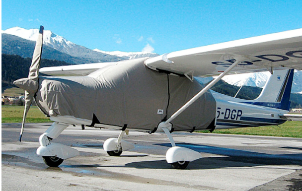
Tecnam Echo Extended Canopy, Engine, Prop Covers

This cover type is made from Silver Acrylic Sunbrella canvas and is 100% lined with a soft and smooth microfiber. Bruce's Custom Covers developed this material combination especially for aircraft protection. The outer material is medium weight and treated for water resistance, UV resistance and anti-static buildup. The inner lining is a very soft and smooth microfiber to prevent scratching. The material is very reflective, and tests show that the cabin interior temperature can be reduced to near-ambient temperature on the hottest of days. It is water, ice and snow repellent, yet breathable to allow moisture to escape from between the cover and the aircraft surface.