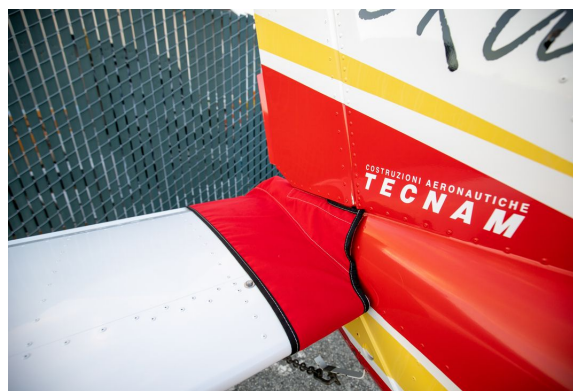
Tecnam Bravo Tailcone Cover