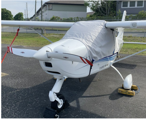
Tecnam P92 EAGLET Canopy Cover Over theTop Style

Travel Covers are made with Silver Solution-Dyed Polyester fabric and only lined over the windshield to save weight. The material is lightweight and more compact for easy stowage in the aircraft. The polyester material is water resistant, but only intended for occasional use outside. We also have an ultra lightweight material available for fitted hangar dust covers. For daily outdoor use, the non-travel Sunbrella Cover is the best choice.