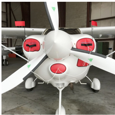
Tecnam P2010 Engine Plugs