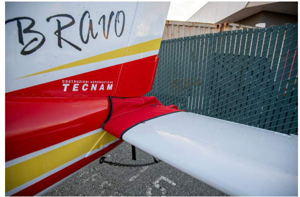
Tecnam Bravo Tailcone Cover