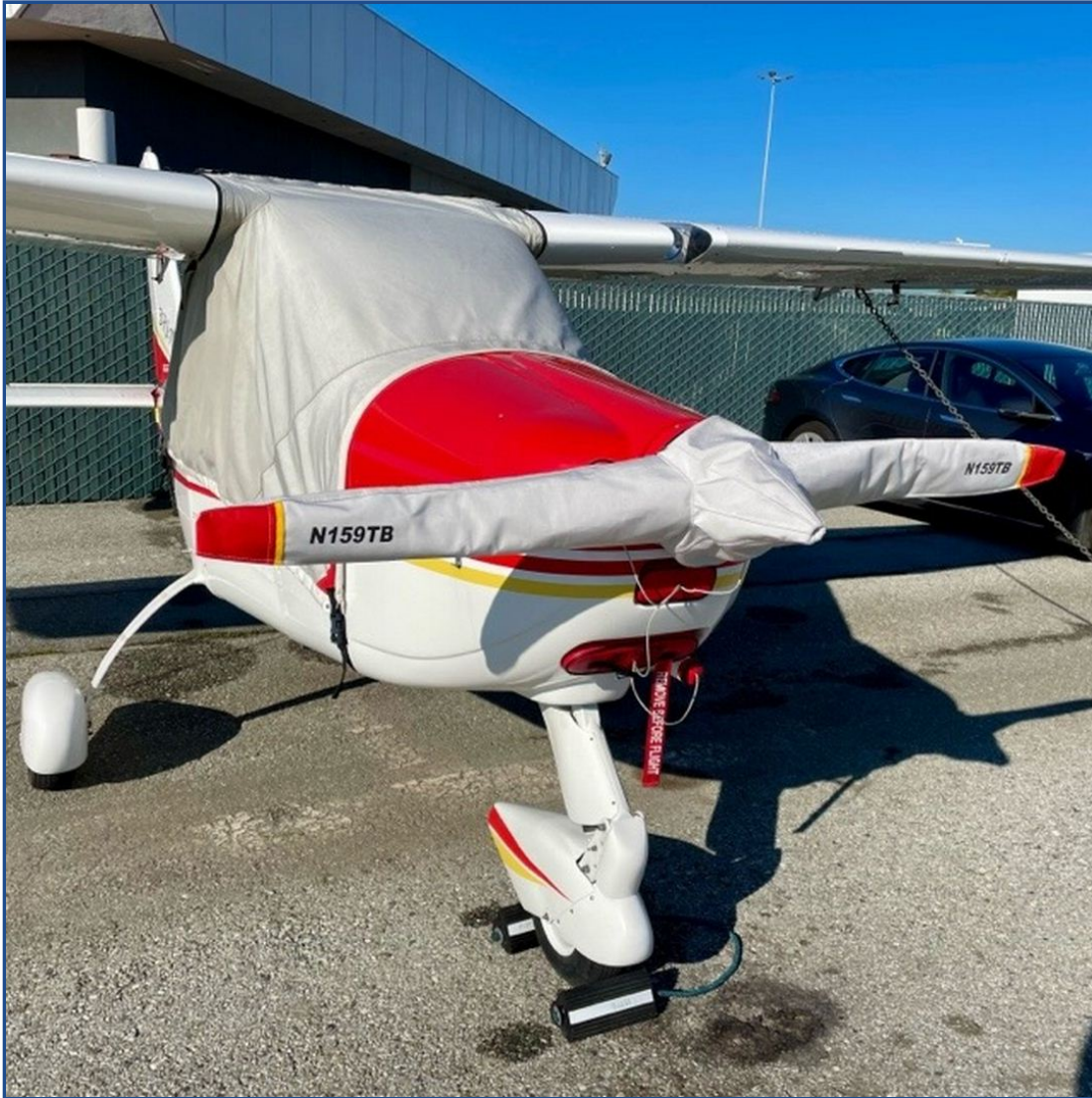
Tecnam Bravo Canopy &amp; Prop Covers, Engine Plugs