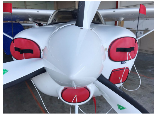
Tecnam Engine Plugs, set of 5