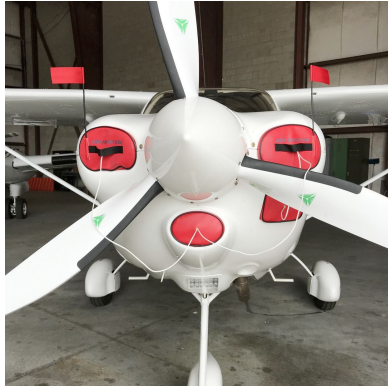
Tecnam P210 Engine Plugs

Engine Inlet Plugs are custom fit for your Tecnam P2008 intakes, made with heavy-duty vinyl material, and stuffed with a single block of sculpted urethane foam. Each plug has a zipper that allows the foam to be removed and dried if necessary. Engine plugs have warning flags that are visible from the cockpit or 'remove before flight' streamers sewn onto the face of the plugs. Most plugs are imprinted with the aircraft registration number in black for an extra charge. Storage bag NOT included. Engine plugs may be inserted after flight when the engine is still warm. Engine Inlet Plugs are commonly referred to as Cowl Plugs, Intake Plugs, Cowl Blocks, Engine Blocks, and Engine Bung.