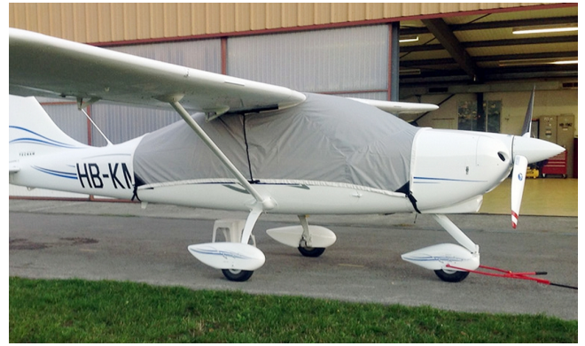
Tecnam P2008 Travel Cover