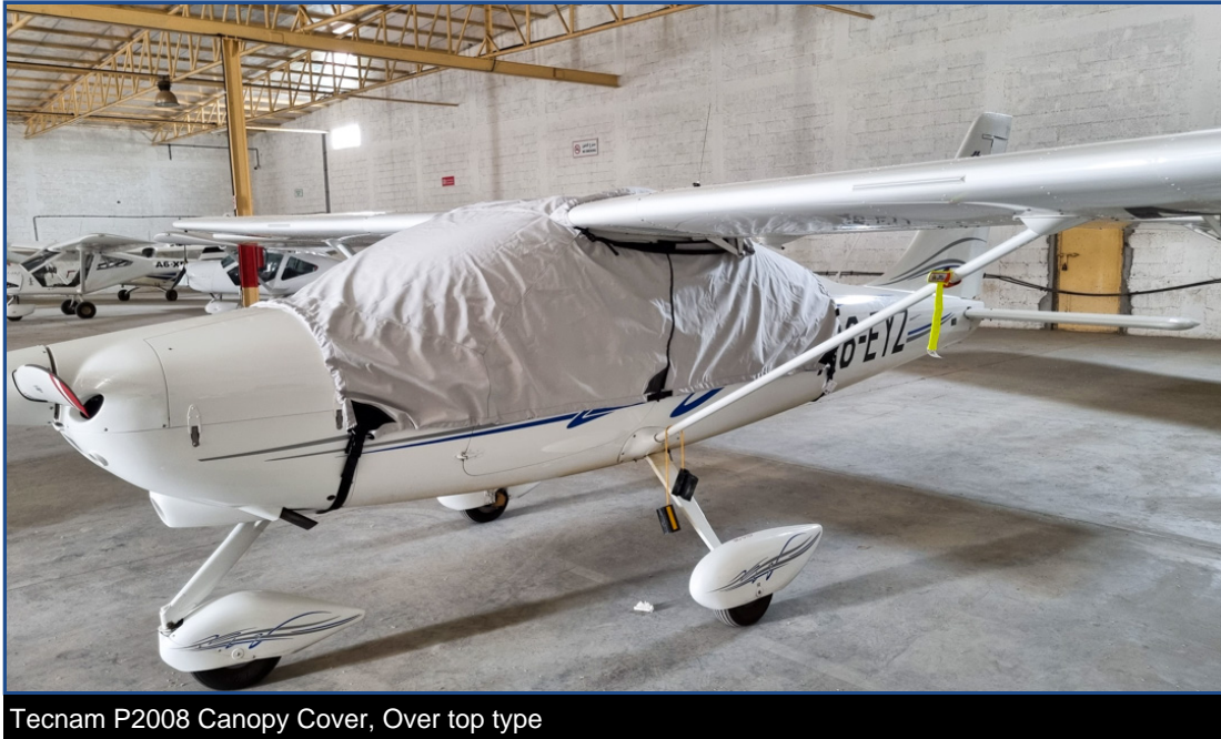
Tecnam P2008 Canopy Cover, Over top type