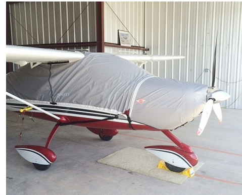
Tecnam P2008 Canopy Cover & Light Weight Engine Cover