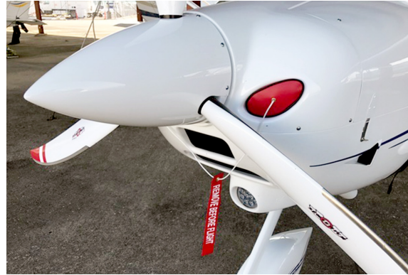
Tecnam P2008 Engine Inlet Plugs