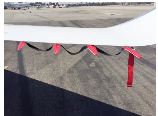
Example photo from a Biz Jet