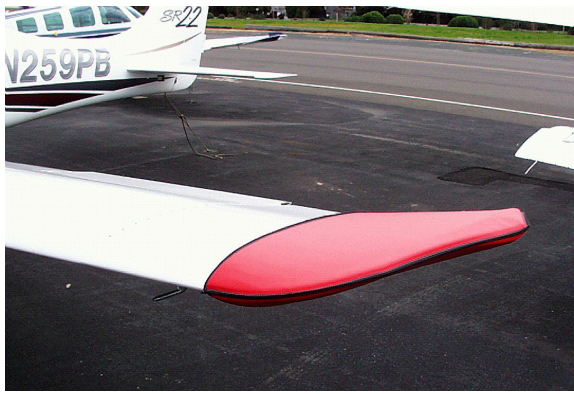
Cirrus SR-22 Wingtip Pad (also available for the Horiz. Stab.)