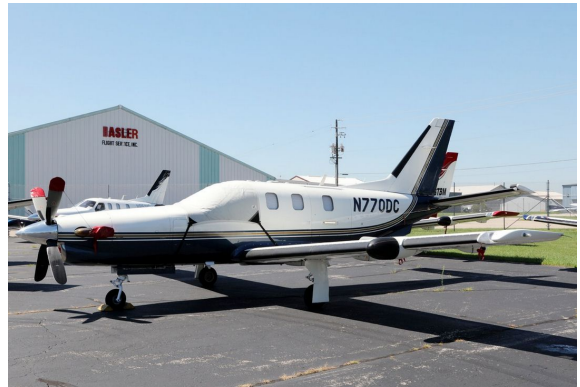
Socata TBM 700 Cockpit Cover, Prop Tie/Exhaust Cover Set