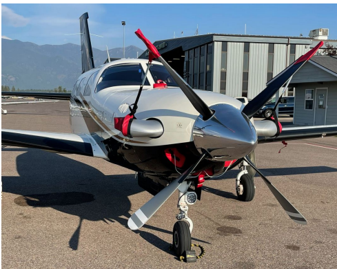
Piper Meridian Prop Tie/Exhaust Cover, Plug Set

This cover type is made from Silver Acrylic Sunbrella canvas and is 100% lined with a soft and smooth microfiber. Bruce's Custom Covers developed this material combination especially for aircraft protection. The outer material is medium weight and treated for water resistance, UV resistance and anti-static buildup. The inner lining is a very soft and smooth microfiber to prevent scratching. The material is very reflective, and tests show that the cabin interior temperature can be reduced to near-ambient temperature on the hottest of days. It is water, ice and snow repellent, yet breathable to allow moisture to escape from between the cover and the aircraft surface.