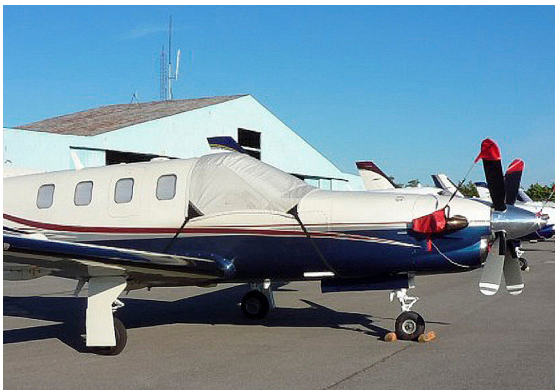
Socata TBM Cockpit Cover, Prop Tie/Exhaust Covers

This cover type is made from Silver Acrylic Sunbrella canvas and is 100% lined with a soft and smooth microfiber. Bruce's Custom Covers developed this material combination especially for aircraft protection. The outer material is medium weight and treated for water resistance, UV resistance and anti-static buildup. The inner lining is a very soft and smooth microfiber to prevent scratching. The material is very reflective, and tests show that the cabin interior temperature can be reduced to near-ambient temperature on the hottest of days. It is water, ice and snow repellent, yet breathable to allow moisture to escape from between the cover and the aircraft surface.