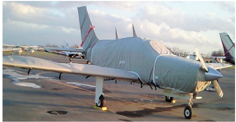
Piper PA-46 Malibu Complete Cover Set