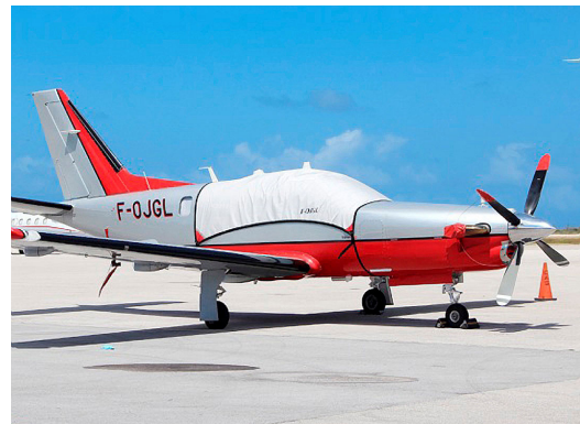
TBM Canopy Cover, Prop Tie/Exhaust Covers