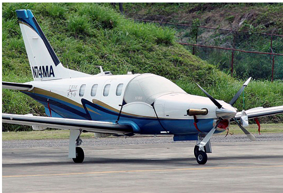
TBM 850 Cockpit Cover

Travel Covers are made with Silver Solution-Dyed Polyester fabric and only lined over the windshield to save weight. The material is lightweight and more compact for easy stowage in the aircraft. The polyester material is water resistant, but only intended for occasional use outside. We also have an ultra lightweight material available for fitted hangar dust covers. For daily outdoor use, the non-travel Sunbrella Cover is the best choice.