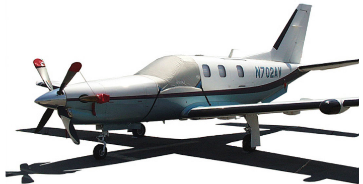
TBM 700 Cockpit Cover, Engine Plugs, Prop Tie/Exhaust Covers