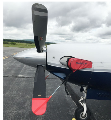
Piper Meridian Prop Tie/Exhaust Covers