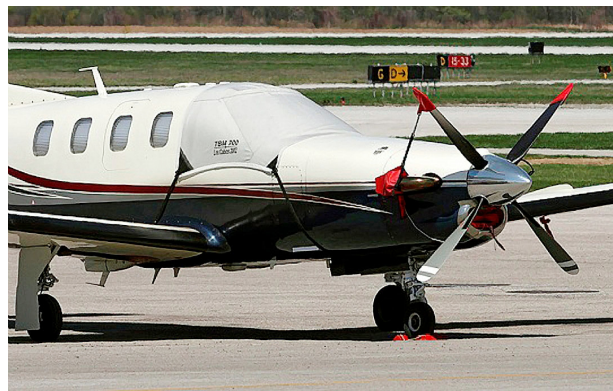
TBM 700 Cockpit Cover, Prop Tie-down/Exhaust Covers, Engine Inlet Plugs & Pitot Cover