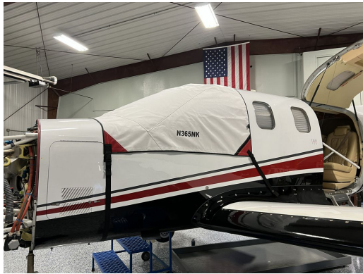
TBM 700 Cockpit Cover

This cover type is made from Silver Acrylic Sunbrella canvas and is 100% lined with a soft and smooth microfiber. Bruce's Custom Covers developed this material combination especially for aircraft protection. The outer material is medium weight and treated for water resistance, UV resistance and anti-static buildup. The inner lining is a very soft and smooth microfiber to prevent scratching. The material is very reflective, and tests show that the cabin interior temperature can be reduced to near-ambient temperature on the hottest of days. It is water, ice and snow repellent, yet breathable to allow moisture to escape from between the cover and the aircraft surface.