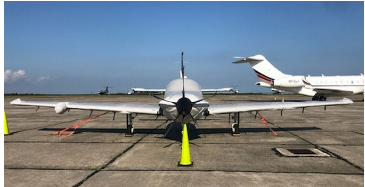
Socata TBM Canopy, Engine, Wing & Horizontal Stabilizer Covers