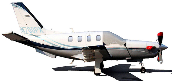
TBM 700 Cockpit Cover & Prop Tie-down/Exhaust Cover Set

Engine Inlet Plugs are custom fit for your Socata TBM 700, 750, 850, 900, 910, 930, 940, 960 intakes, made with heavy-duty vinyl material, and stuffed with a single block of sculpted urethane foam. Each plug has a zipper that allows the foam to be removed and dried if necessary. Engine plugs have warning flags that are visible from the cockpit or 'remove before flight' streamers sewn onto the face of the plugs. Most plugs are imprinted with the aircraft registration number in black for an extra charge. Storage bag NOT included. Engine plugs may be inserted after flight when the engine is still warm. Engine Inlet Plugs are commonly referred to as Cowl Plugs, Intake Plugs, Cowl Blocks, Engine Blocks, and Engine Bung s. Designed to prevent damage to the aircraft extremities in crowded hangars, these products are made of bright red Naugahyde and thickly padded with a sandwich of closed cell foam.