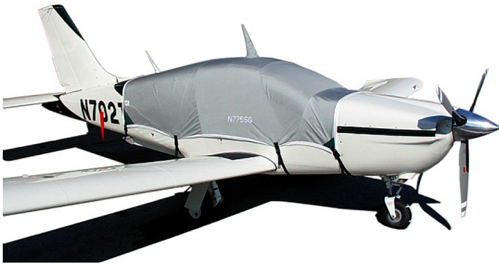
TB20 Standard Canopy Cover

This cover type is made from Silver Acrylic Sunbrella canvas and is 100% lined with a soft and smooth microfiber. Bruce's Custom Covers developed this material combination especially for aircraft protection. The outer material is medium weight and treated for water resistance, UV resistance and anti-static buildup. The inner lining is a very soft and smooth microfiber to prevent scratching. The material is very reflective, and tests show that the cabin interior temperature can be reduced to near-ambient temperature on the hottest of days. It is water, ice and snow repellent, yet breathable to allow moisture to escape from between the cover and the aircraft surface.