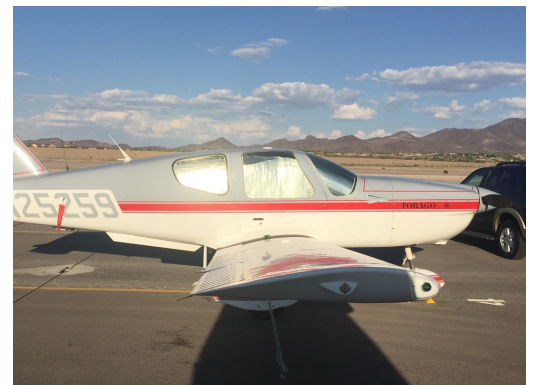
Socata TB-10 Cabin HeatShields