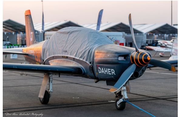
Socata TB-30 Epsilon Canopy Cover