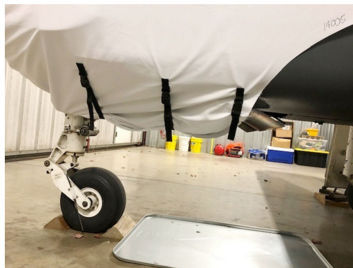
Socata Epsilon TB-30 Insulated Engine Cover, test fit cover