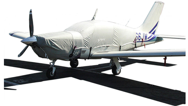
Canopy Cover & Engine Cover