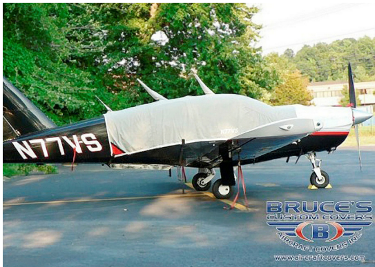
Socata TB20 Canopy Cover

Travel Covers are made with Silver Solution-Dyed Polyester fabric and only lined over the windshield to save weight. The material is lightweight and more compact for easy stowage in the aircraft. The polyester material is water resistant, but only intended for occasional use outside. We also have an ultra lightweight material available for fitted hangar dust covers. For daily outdoor use, the non-travel Sunbrella Cover is the best choice.