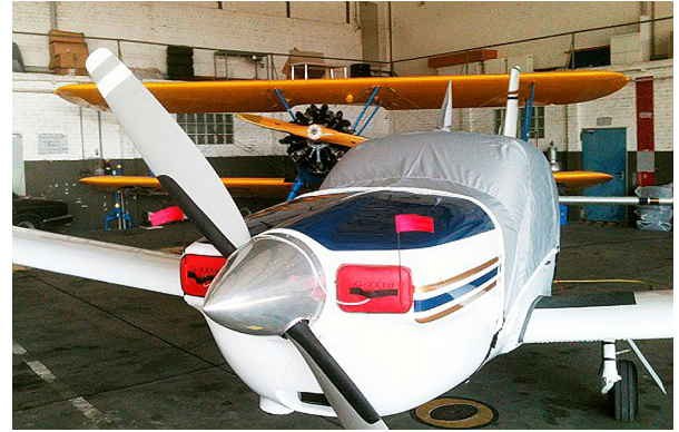
Socata TB20 Canopy Cover and Engine Inlet Plugs