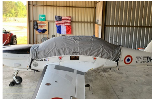
Socata TB-30 Travel Weight Canopy Cover