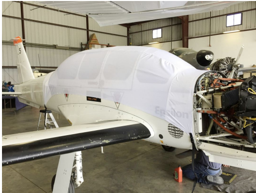
Socata TB30 Epsilon Canopy Cover, test fit cover

Travel Covers are made with Silver Solution-Dyed Polyester fabric and only lined over the windshield to save weight. The material is lightweight and more compact for easy stowage in the aircraft. The polyester material is water resistant, but only intended for occasional use outside. We also have an ultra lightweight material available for fitted hangar dust covers. For daily outdoor use, the non-travel Sunbrella Cover is the best choice.