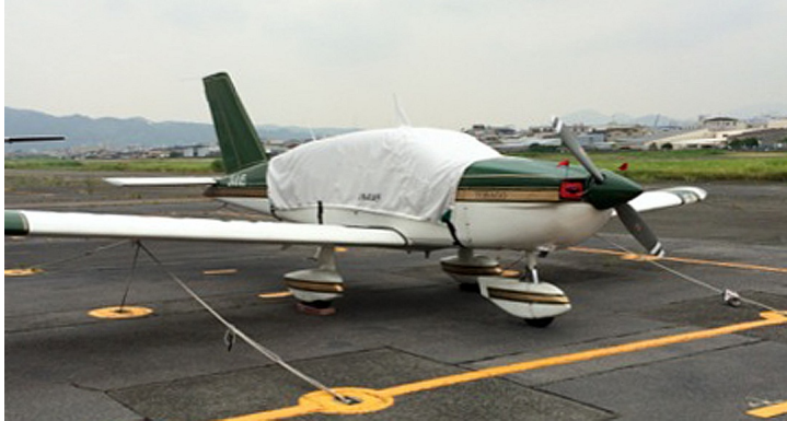
Socata TB-20 Canopy Cover

This cover type is made from Silver Acrylic Sunbrella canvas and is 100% lined with a soft and smooth microfiber. Bruce's Custom Covers developed this material combination especially for aircraft protection. The outer material is medium weight and treated for water resistance, UV resistance and anti-static buildup. The inner lining is a very soft and smooth microfiber to prevent scratching. The material is very reflective, and tests show that the cabin interior temperature can be reduced to near-ambient temperature on the hottest of days. It is water, ice and snow repellent, yet breathable to allow moisture to escape from between the cover and the aircraft surface.