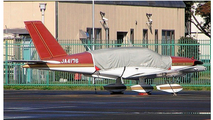
Socata TB-10 Tampico Canopy Cover