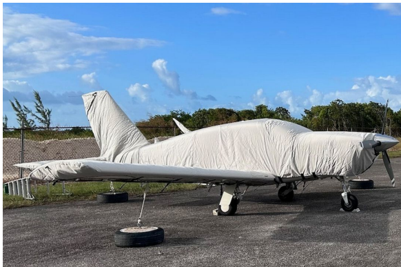
Socata TB-20 Trinidad Complete Cover Set

WINTER USE MATERIAL - Made with Solution-Dyed Polyester fabric, this option is intended for seasonal use to aid in deicing, rain mitigation, or for occasional travel. The material is lighter and more compact, but more susceptible to UV damage and may have a shorter useful life if used continuously outside than the all-year use material.