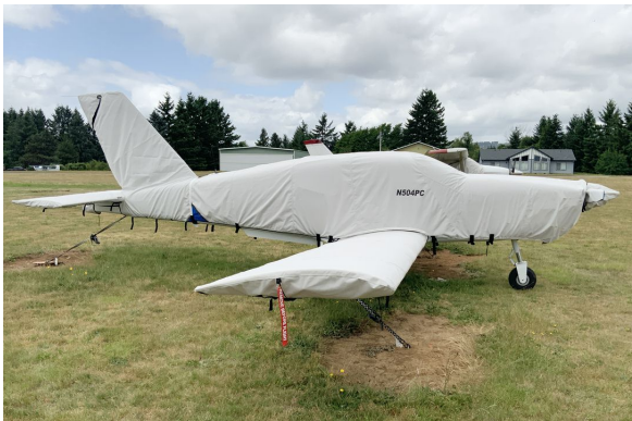
Socata Tampico TB-9C Cover Set