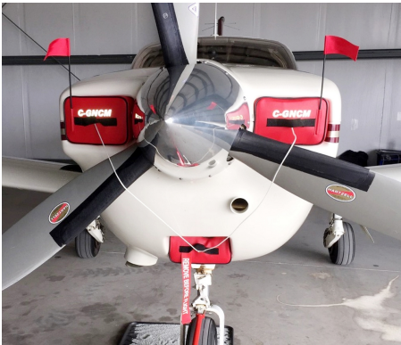
Socata TB-20 Engine Plugs, set of 3

Engine Inlet Plugs are custom fit for your Socata TB9-GT, Tobago: TB10-GT & TB200-GT, Trinidad: TB20-GT, TB21-GT intakes, made with heavy-duty vinyl material, and stuffed with a single block of sculpted urethane foam. Each plug has a zipper that allows the foam to be removed and dried if necessary. Engine plugs have warning flags that are visible from the cockpit or 'remove before flight' streamers sewn onto the face of the plugs. Most plugs are imprinted with the aircraft registration number in black for an extra charge. Storage bag NOT included. Engine plugs may be inserted after flight when the engine is still warm. Engine Inlet Plugs are commonly referred to as Cowl Plugs, Intake Plugs, Cowl Blocks, Engine Blocks, and Engine Bungs.