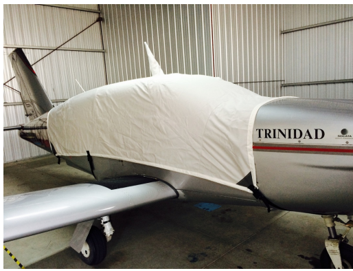
Trinidad Canopy Cover