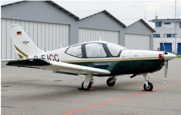
Socata Tobago TB20 Heatshields