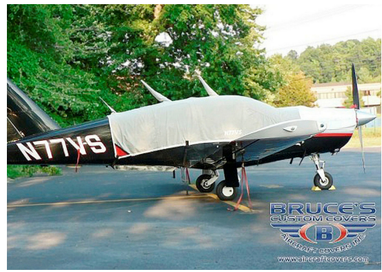
Socata TB20 Canopy Cover