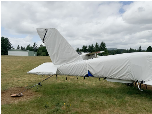
Socata Tampico TB-9C Cover Set