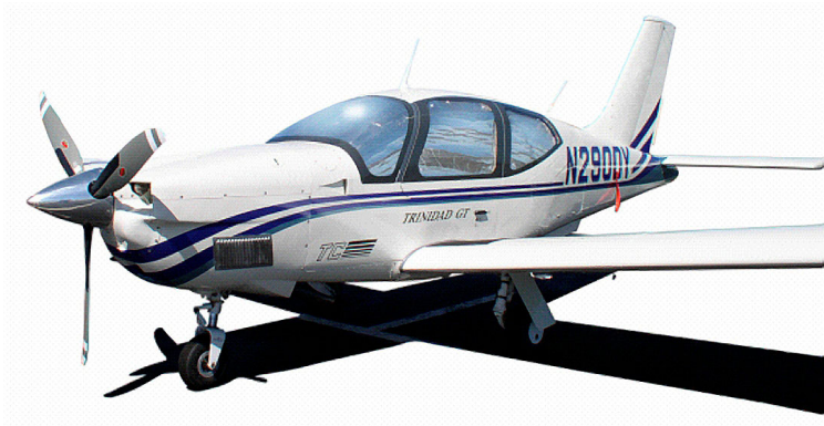
Socata TB20 HeatShields

Windshield Heatshields are interior sunshades for an aircraft's front windshield. The product is a unique composite of closed-cell foam with a silver mylar finish. The semi-rigid design is stiff enough to stand along the inside of the windshield using sun visors or window framing. It folds up flat and easily stores in the included storage sleeve. Some designs may require velcro and suction cups or split right and left sides. A Heatshield is an excellent short-term remedy for cockpit overheating. An external fabric cover is far more effective and practical for long-term protection.