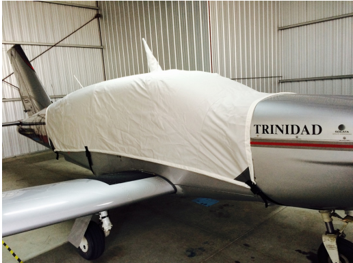
Trinidad Canopy Cover

This cover type is made from Silver Acrylic Sunbrella canvas and is 100% lined with a soft and smooth microfiber. Bruce's Custom Covers developed this material combination especially for aircraft protection. The outer material is medium weight and treated for water resistance, UV resistance and anti-static buildup. The inner lining is a very soft and smooth microfiber to prevent scratching. The material is very reflective, and tests show that the cabin interior temperature can be reduced to near-ambient temperature on the hottest of days. It is water, ice and snow repellent, yet breathable to allow moisture to escape from between the cover and the aircraft surface.