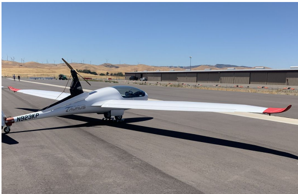
Pipistrel Taurus & Electro Wingtip Pads

Designed to prevent damage to the wingtip in crowded hangars or high traffic areas, these products are made of bright red Naugahyde and thickly padded with a sandwich of closed cell foam. Protects delicate winglets, casters and their housings, and soft finishes.