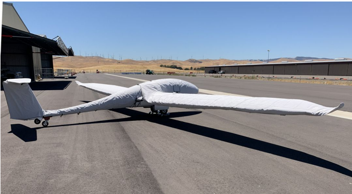
Sailplane Full Cover Set Graphic Indicators (Discus 2B, 3D model) Pipistrel Taurus & Electro Wing Covers, 15 Meter Wingspan, All Year Use