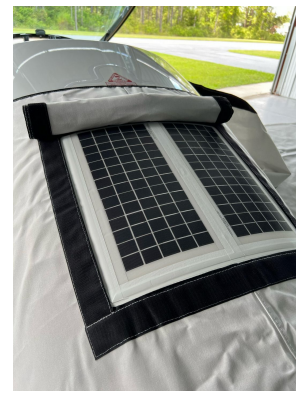
Pipistrel Taurus Complete Cover Set