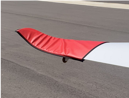
Pipistrel Taurus & Electro Wingtip Pads

Designed to prevent damage to the wingtip in crowded hangars or high traffic areas, these products are made of bright red Naugahyde and thickly padded with a sandwich of closed cell foam. Protects delicate winglets, casters and their housings, and soft finishes.