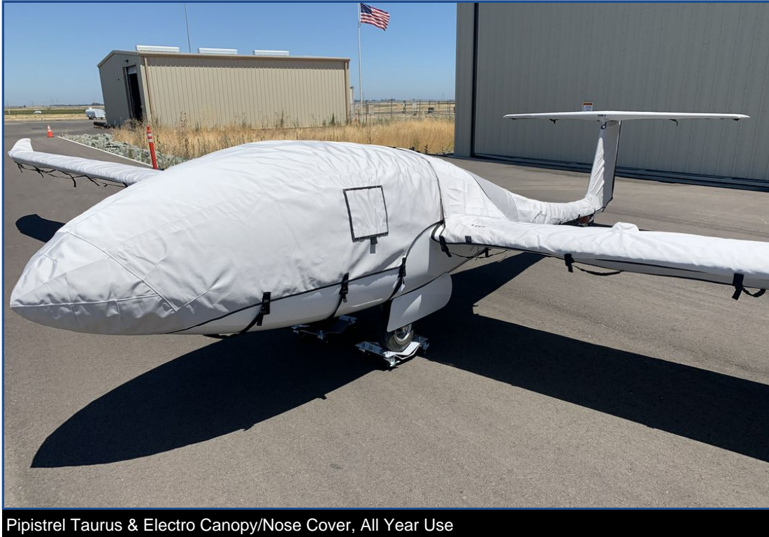
Pipistrel Taurus &amp; Electro Canopy/Nose Cover, All Year Use