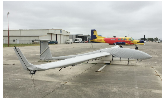
Pipistrel Taurus Canopy/Nose Cover with Turtledeck Extension DG-505 Canopy/Nose, Wing, Empennage & Horiz. Stab. Covers