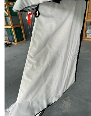
Pipistrel Taurus & Electro Empennage Cover, Incl. Horiz. Stab., All Year Use