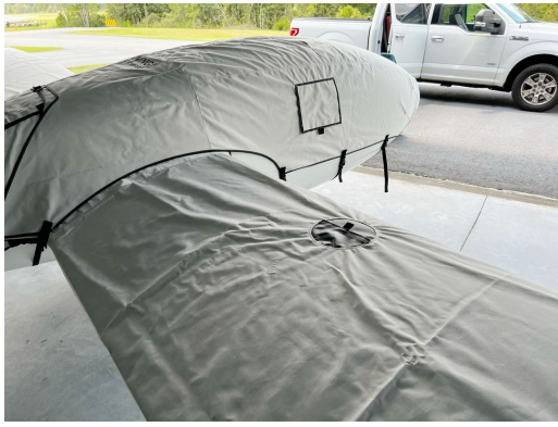
Pipistrel Taurus Complete Cover Set