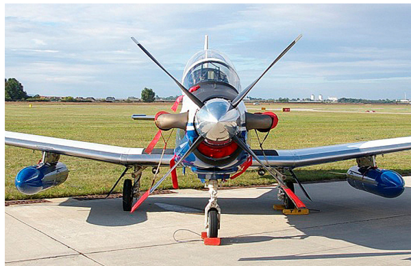
Texan II T6A Engine Inlet Plug, Prop Tie/Exhaust Covers