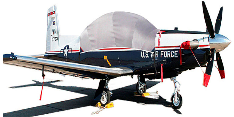
Texan II T6A Canopy Cover, Engine Inlet Plug, Prop Tie/Exhaust Covers, Pitot Cover