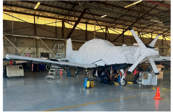
Beech T-6A Texan 2 Complete Hail Protection Cover Set