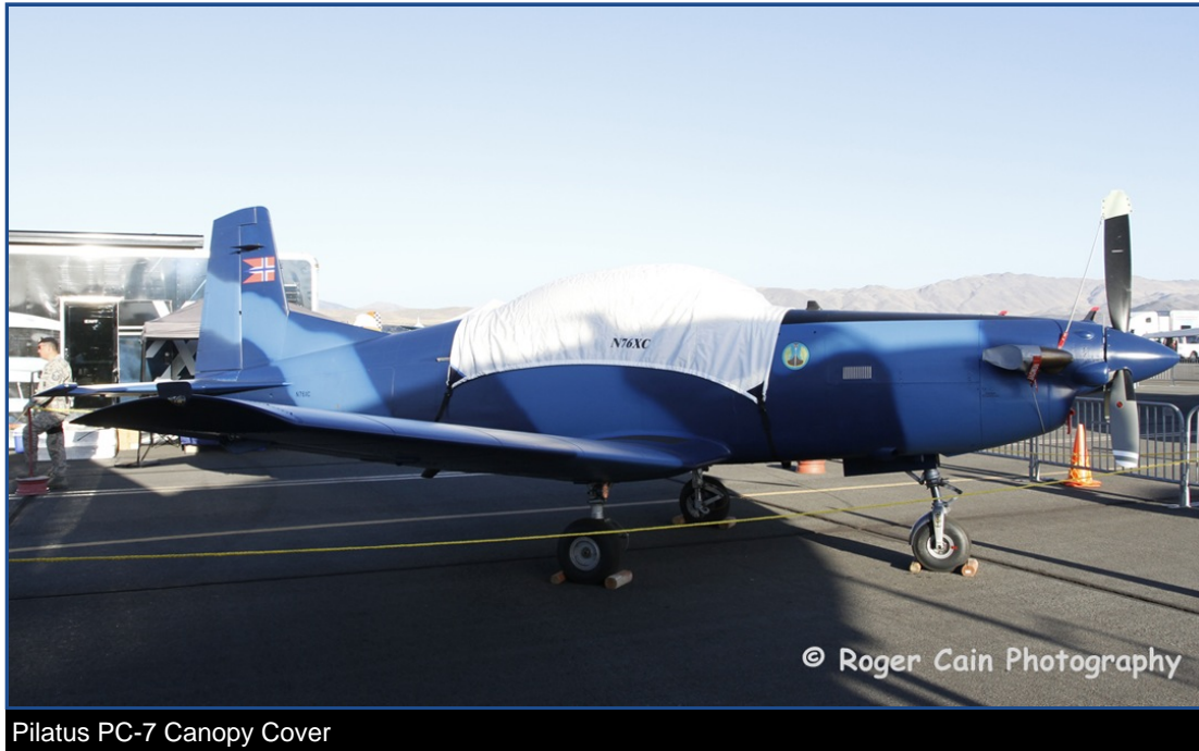
Pilatus PC-7 Canopy Cover