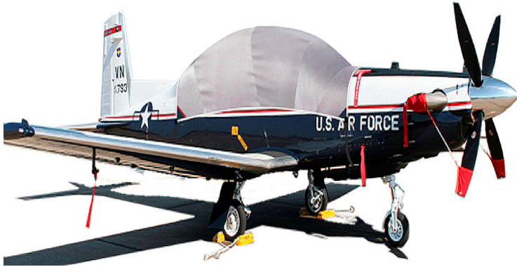
Texan II T6A Canopy Cover, Engine Inlet Plug, Prop Tie/Exhaust Covers, Pitot Cover

This cover type is made from Silver Acrylic Sunbrella canvas and is 100% lined with a soft and smooth microfiber. Bruce's Custom Covers developed this material combination especially for aircraft protection. The outer material is medium weight and treated for water resistance, UV resistance and anti-static buildup. The inner lining is a very soft and smooth microfiber to prevent scratching. The material is very reflective, and tests show that the cabin interior temperature can be reduced to near-ambient temperature on the hottest of days. It is water, ice and snow repellent, yet breathable to allow moisture to escape from between the cover and the aircraft surface.