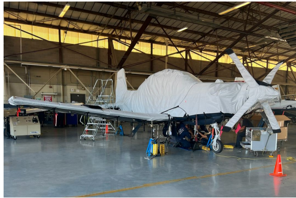
Beech T-6A Texan 2 Complete Hail Protection Cover Set

WINTER USE MATERIAL - Made with Solution-Dyed Polyester fabric, this option is intended for seasonal use to aid in deicing, rain mitigation, or for occasional travel. The material is lighter and more compact, but more susceptible to UV damage and may have a shorter useful life if used continuously outside than the all-year use material.