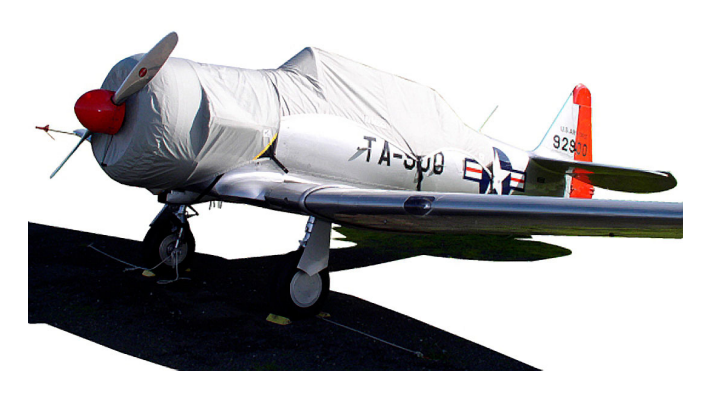
Canopy, Engine & Pitot Cover

This cover type is made from Silver Acrylic Sunbrella canvas and is 100% lined with a soft and smooth microfiber. Bruce's Custom Covers developed this material combination especially for aircraft protection. The outer material is medium weight and treated for water resistance, UV resistance and anti-static buildup. The inner lining is a very soft and smooth microfiber to prevent scratching. The material is very reflective, and tests show that the cabin interior temperature can be reduced to near-ambient temperature on the hottest of days. It is water, ice and snow repellent, yet breathable to allow moisture to escape from between the cover and the aircraft surface.