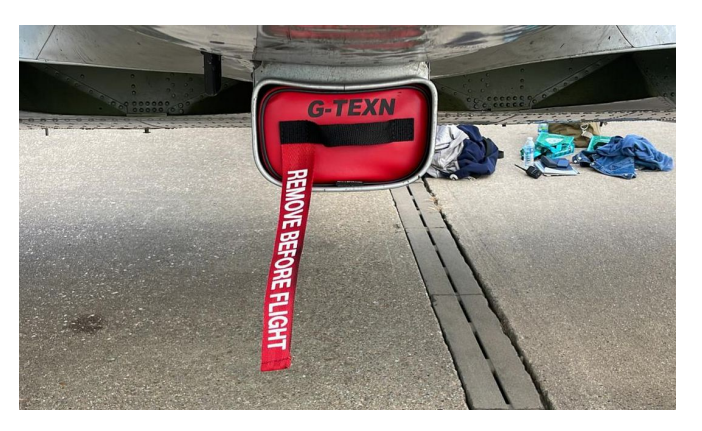
T6 Harvard Chin Scoop Plug

Engine Inlet Plugs are custom fit for your North American T6, SNJ, Harvard intakes, made with heavy-duty vinyl material, and stuffed with a single block of sculpted urethane foam. Each plug has a zipper that allows the foam to be removed and dried if necessary. Engine plugs have warning flags that are visible from the cockpit or 'remove before flight' streamers sewn onto the face of the plugs. Most plugs are imprinted with the aircraft registration number in black for an extra charge. Storage bag NOT included. Engine plugs may be inserted after flight when the engine is still warm. Engine Inlet Plugs are commonly referred to as Cowl Plugs, Intake Plugs, Cowl Blocks, Engine Blocks, and Engine Bungs.