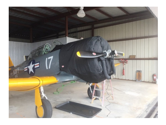
North American SNJ-4 Insulated Engine Cover with Aerotherm Preheater Access Flaps