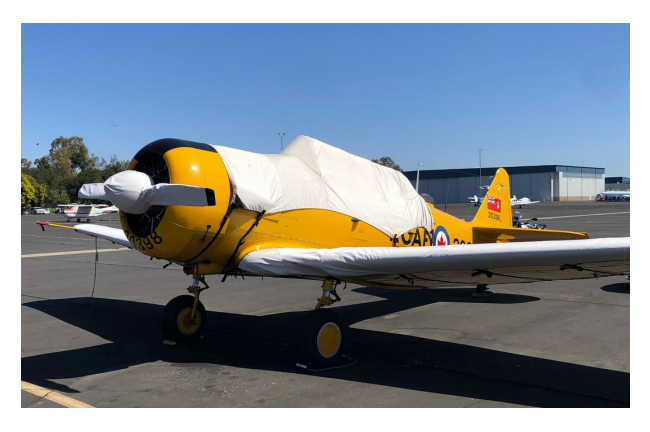
North American Harvard T6 Canopy, Prop & Wing Covers