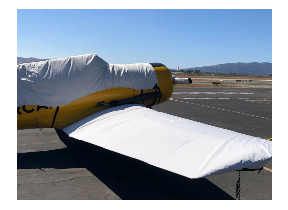
North American Harvard T6 Canopy & Wing Covers

WINTER USE MATERIAL - Made with Solution-Dyed Polyester fabric, this option is intended for seasonal use to aid in deicing, rain mitigation, or for occasional travel. The material is lighter and more compact, but more susceptible to UV damage and may have a shorter useful life if used continuously outside than the all-year use material.