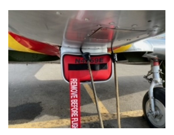
North American T6 Chin Scoop Plug