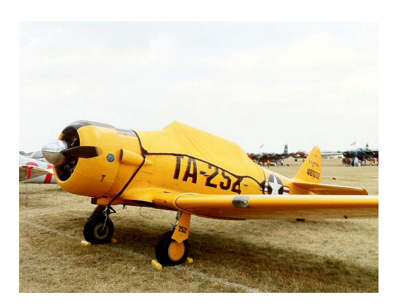
North American T6 Travel Cover, Light Weight Canopy Cover with 50" fwd ext