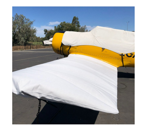
North American T6 Canopy Cover